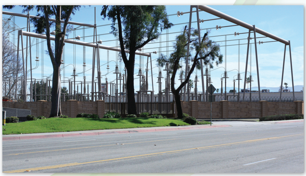
Simulated view looking southeast from Pipeline Avenue toward the proposed ETS.