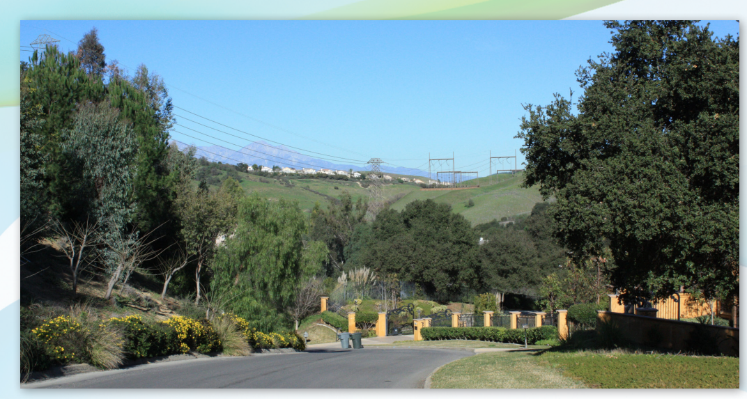
Simulated view looking northeast from Esquilime Drive toward the WTS.