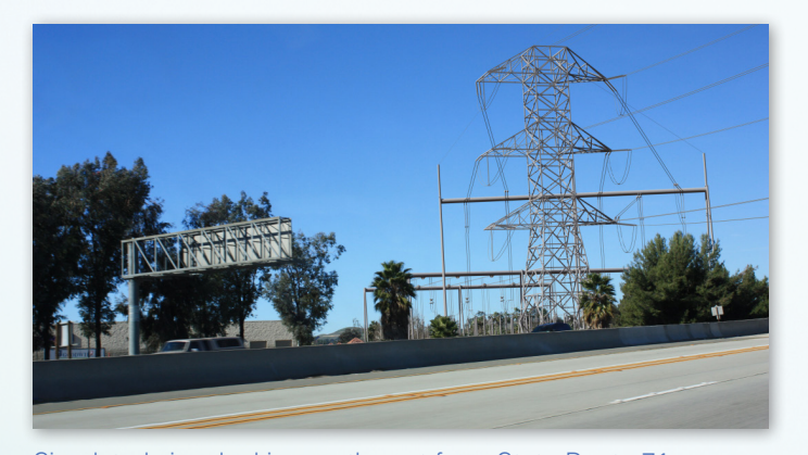
Simulated view looking northwest from State Route 71 toward the ETS.

There will be periods of night work at the ETS location in order to reduce construction noise impacts to the Montessori School of Chino Hills.