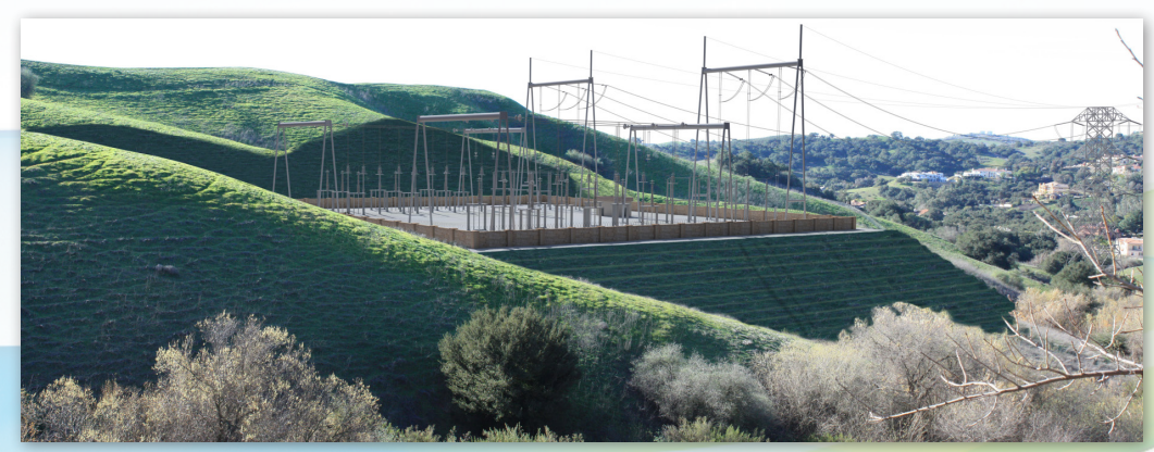
Simulated view looking southwest from the hillside behind the row of homes on the south side of Avenida Compadres toward the WTS.

In addition to the transition stations, two new 500kV lattice steel transmission structures will be necessary—one adjacent to each transition station—to support the overhead wires transitioning into the stations. The transmission structure west of the WTS will be approximately 180 feet tall, and the transmission structure east of the ETS will be approximately 165 feet tall.