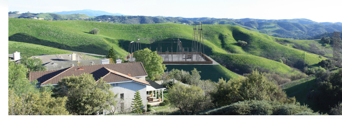
Simulated view looking south-southeast from the hillside above the service road at the end of Avenida Compadres toward the WTS.

Transition stations are facilities that allow overhead lines to transition to underground cables. Two transition stations will be built in Chino Hills to support the TRTP 500kV Underground Project: the West Transition Station (WTS), located at the western end of Eucalyptus Avenue, and the East Transition Station (ETS) located on the east side of Pipeline Avenue.