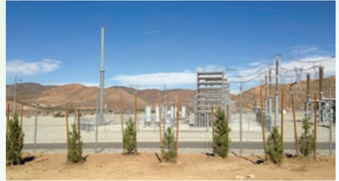
Earlier this year TRTP installed trees around the Vincent Substation.

For a summary of construction updates during the next three months, please see the Upcoming Construction Activities section inside this newsletter or visit our project website at www.sce.com/trtp .