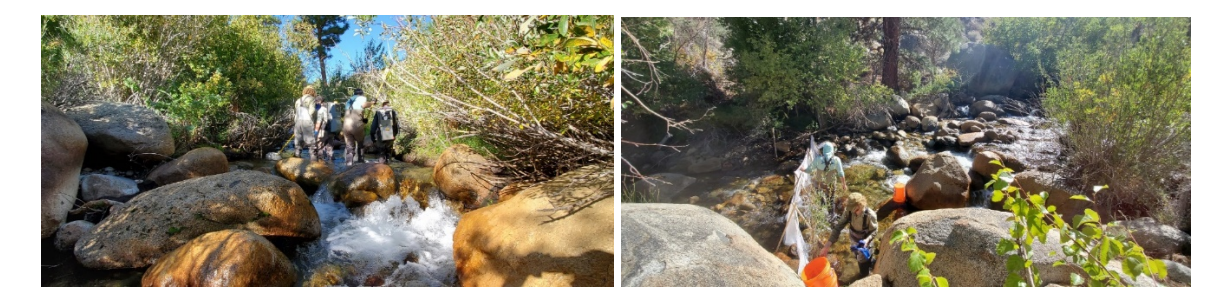
PHOTO PLATE 4. CASCADE/STEP POOL MESOHABITAT IN REACH 4, BISHOP CREEK.

Reach 4 is dominated by very high gradient riffles (i.e., approximately 5% or greater slopes); cascades (25%) and step pools (23%). The TWG concluded that this site would be best documented using the HCM methodology. It was agreed that the field team could select two pools to survey. Each pool should depict a balance of different cover quality and volume conditions to the extent possible.