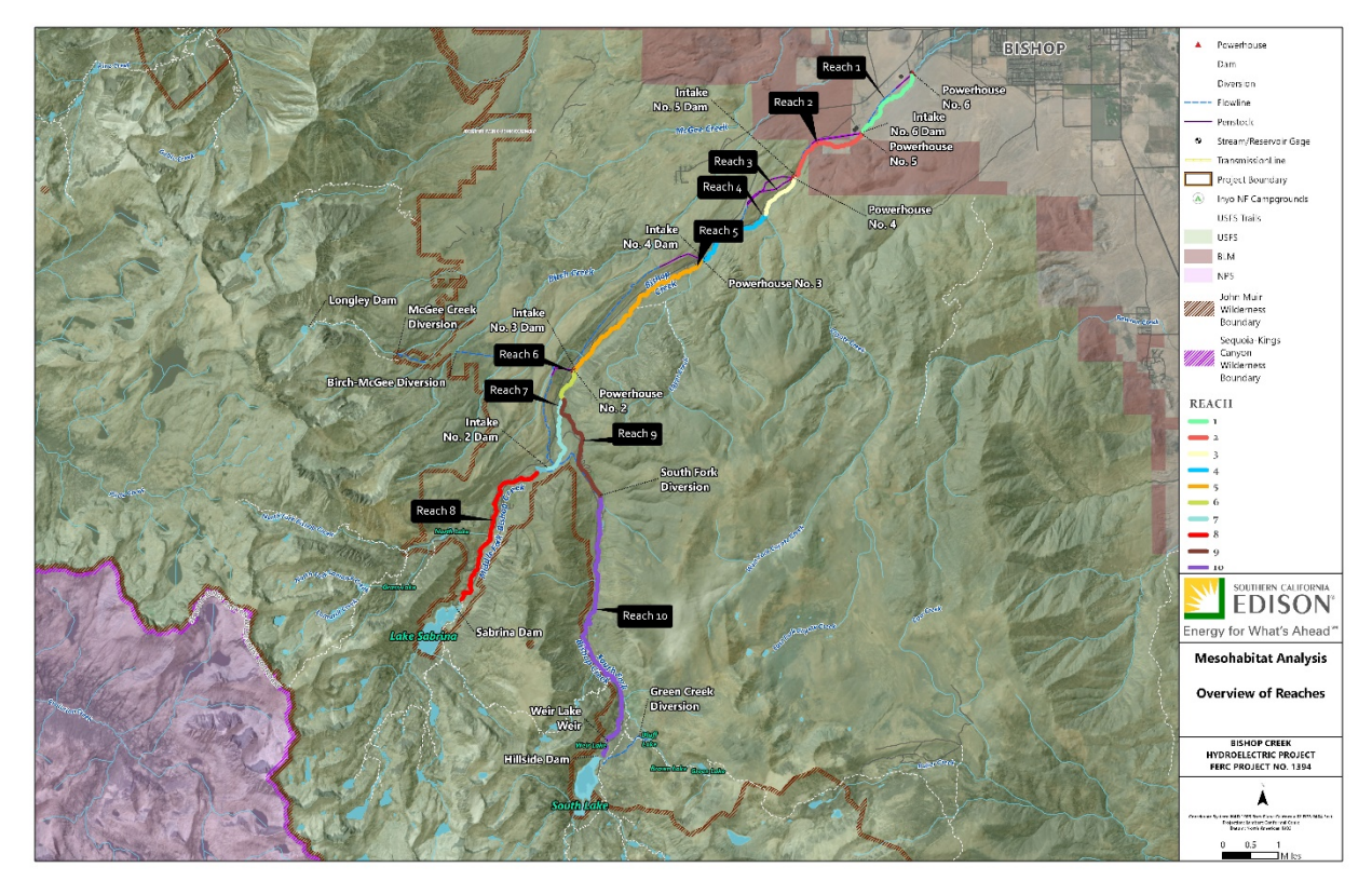
FIGURE 1 BISHOP CREEK IFIM STUDY AREA.