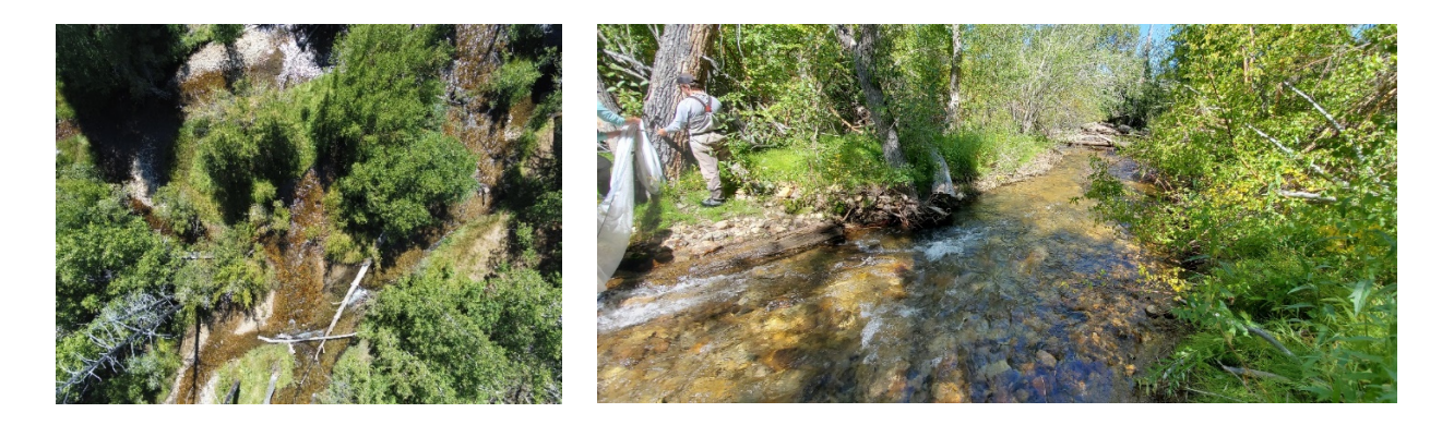
PHOTO PLATE 7. REPRESENTATIVE RUN-POOL, RIFFLE, MESOHABITAT IN REACH 8, MIDDLE FORK BISHOP CREEK.

Reach 8 contains significant low gradient habitats, including consecutive run, run-pool, and pool habitat in the Aspendell vicinity, collectively contributing approximately 19% of the mesohabitat in this reach. This area has numerous braided channels, woody debris and varied substrates. Such expansive complexes are relatively unique in this watershed and are rich in woody debris cover, including scour holes, undercut banks, and overhead cover. The TWG concluded that this was the most critical habitat to model in this reach. However, after review of video and photos, it was concluded that a site visit would be required to adequately select transects<sup>2</sup>. It is anticipated that 3 or 4 transects may be required to characterize the critical mesohabitat in this reach.