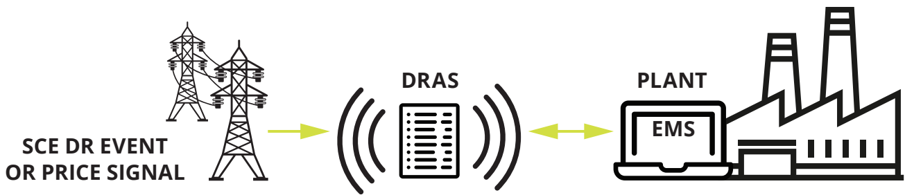
Auto-DR in action during a DR Event.