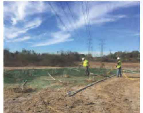
Crews conducting restoration work.

PRESENTED FIRST CLASS U.S. POSTAGE PAID LOS ANGELES, CA PERMIT #59