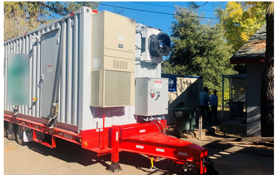
Pine Valley Community Club House