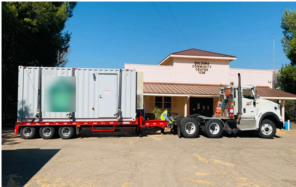
Dulzura Community Center