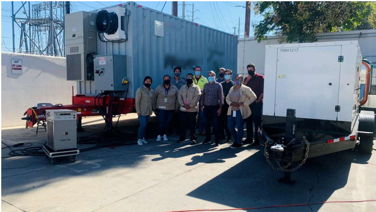
100 kW/525 kWh (only 1 string available)