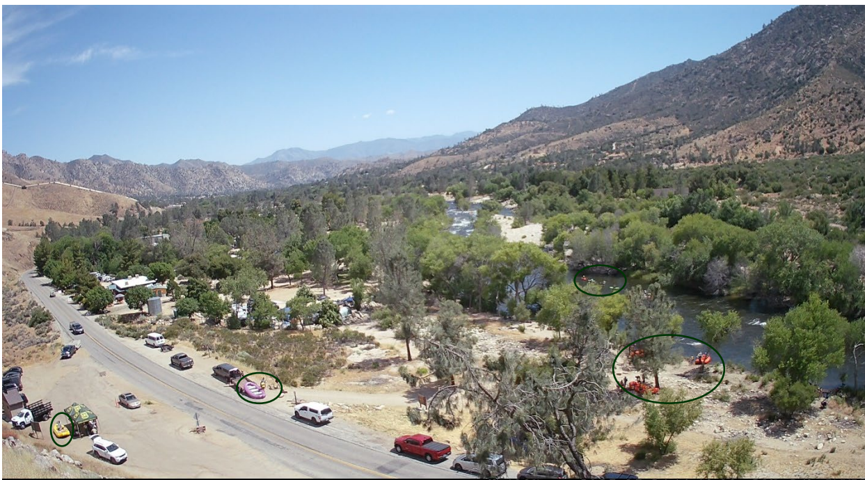
CEYOMUR 100% 2025/05/24 14:40:00 29C 84F RVKRB