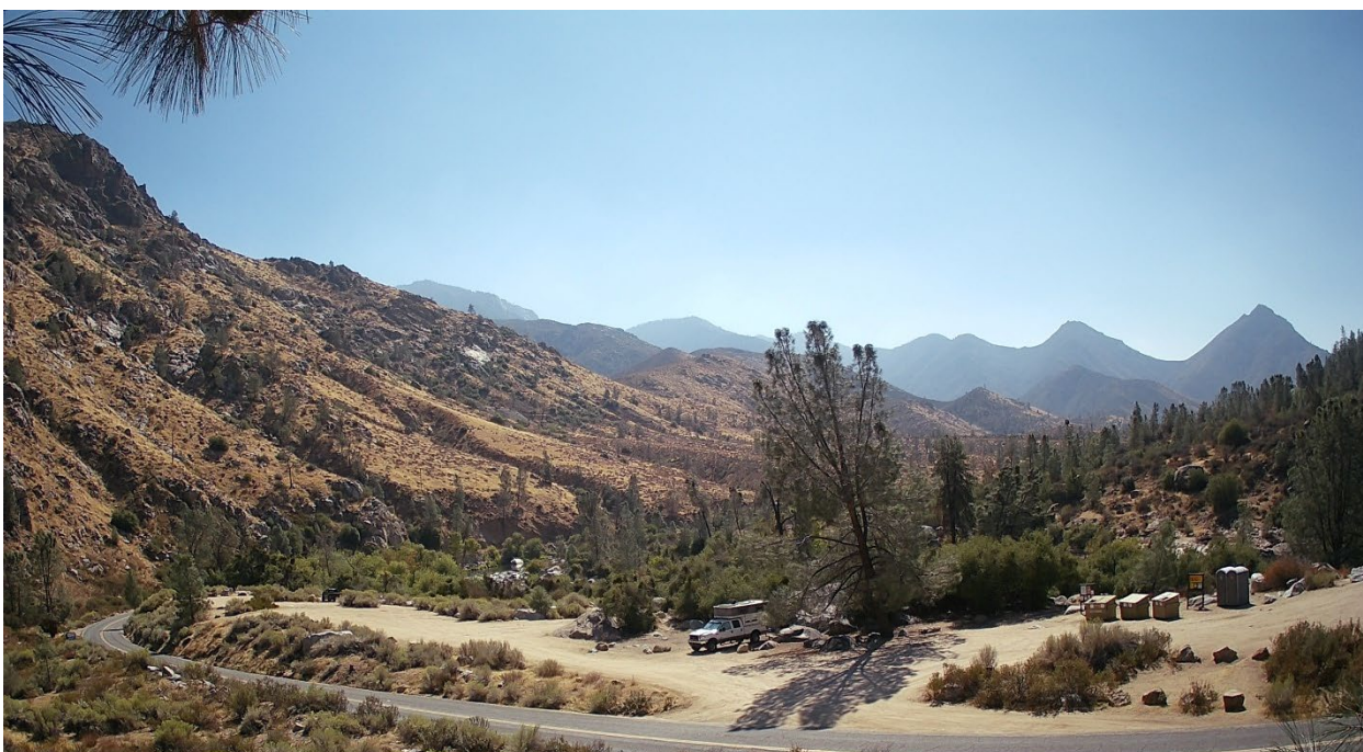
CEYOMUR 100% 2025/09/30 11:05:00 23C 73F ANT