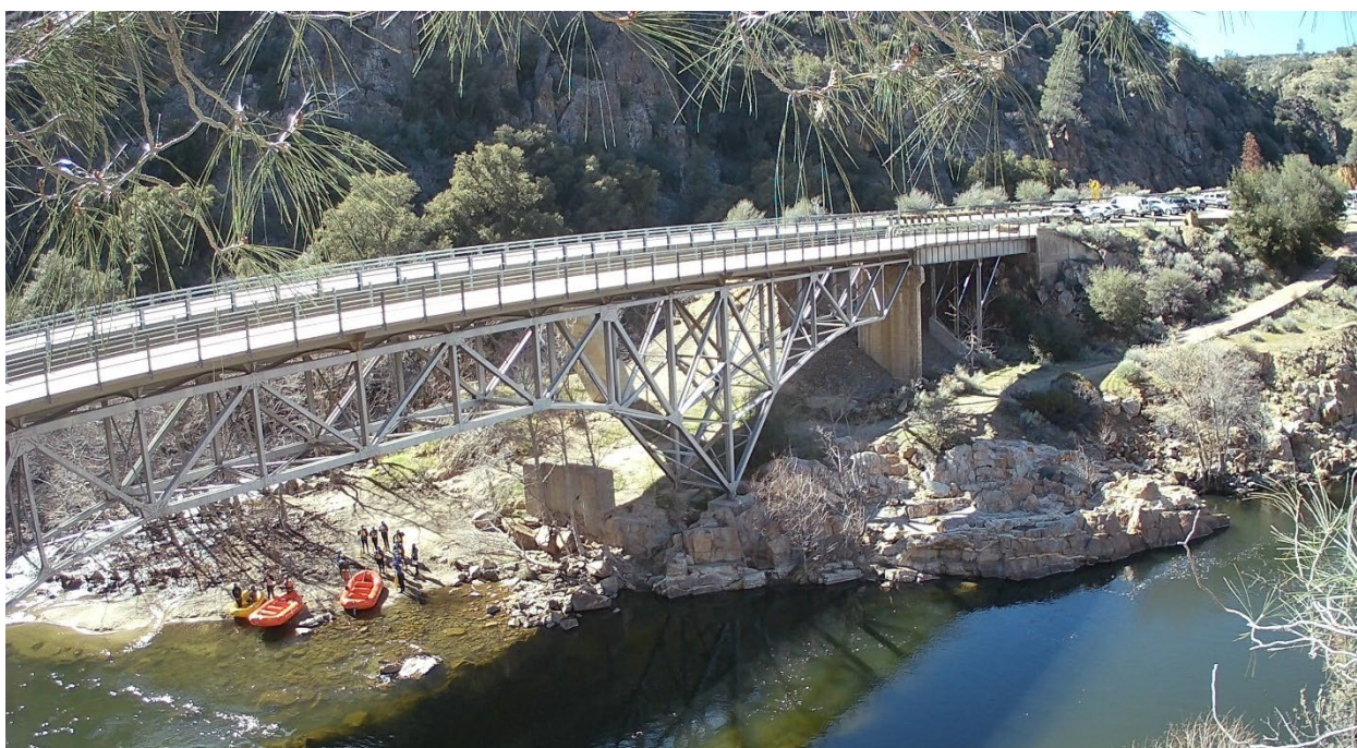
CEYOMUR 100% 2025/03/08 14:20:00 15C 59F JHNBG