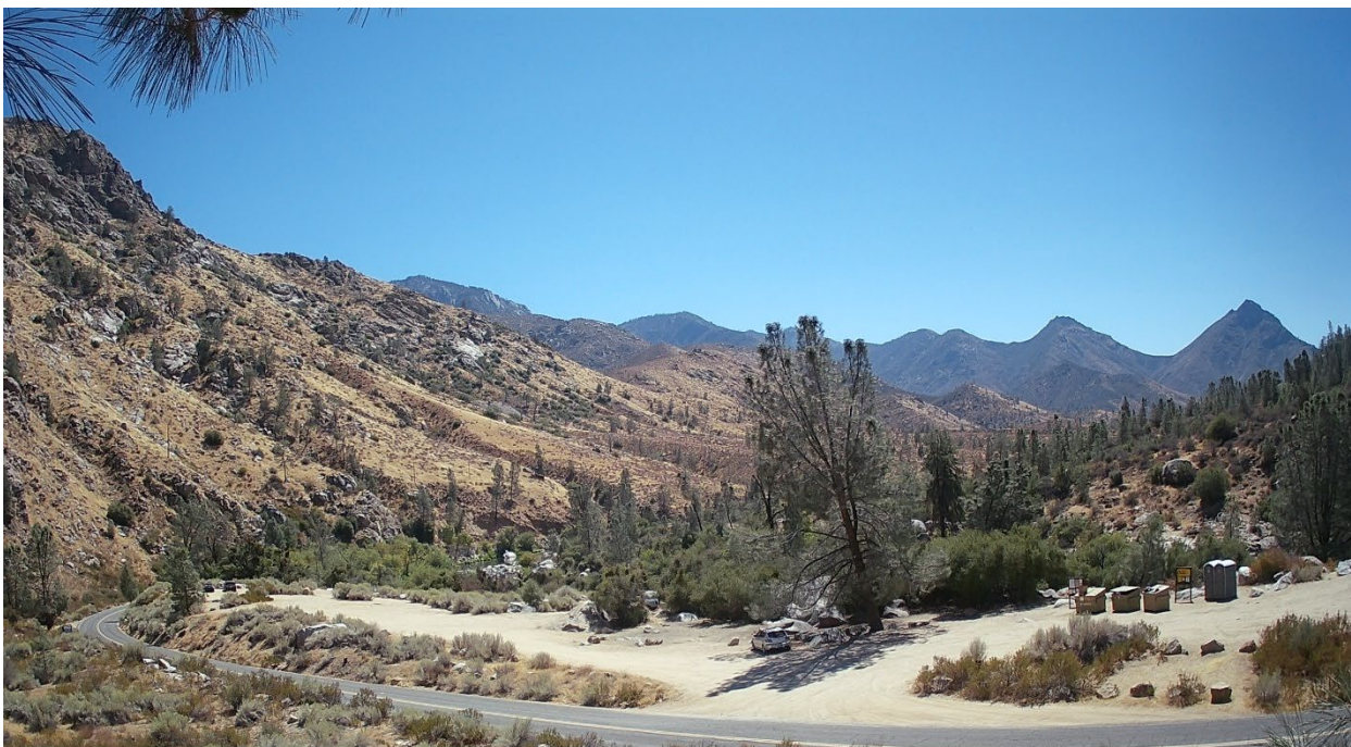
CEYOMUR 100% 2025/09/07 11:55:00 30C 86F ANT