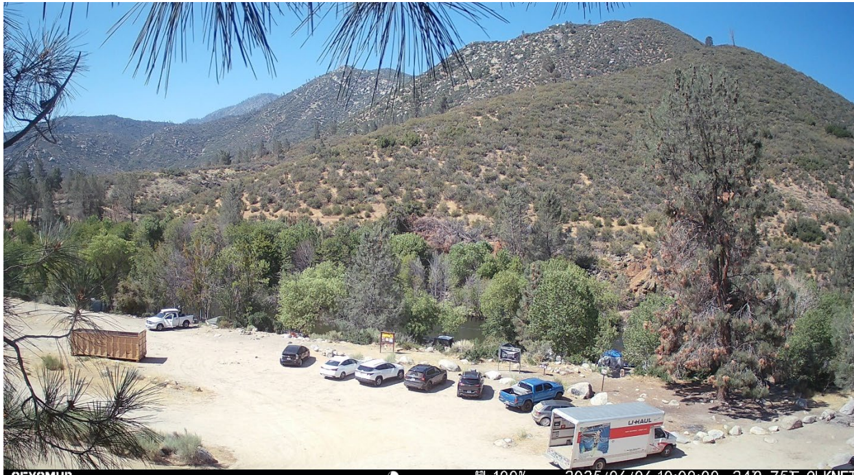
CEYOMUR 100% 2025/06/06 10:00:00 24C 75F CLKNET