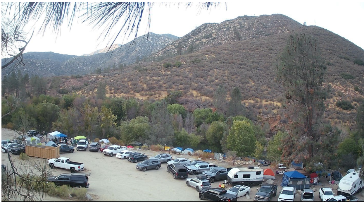
CEYOMUR 100% 2025/09/13 07:00:01 11C 51F CLKNET