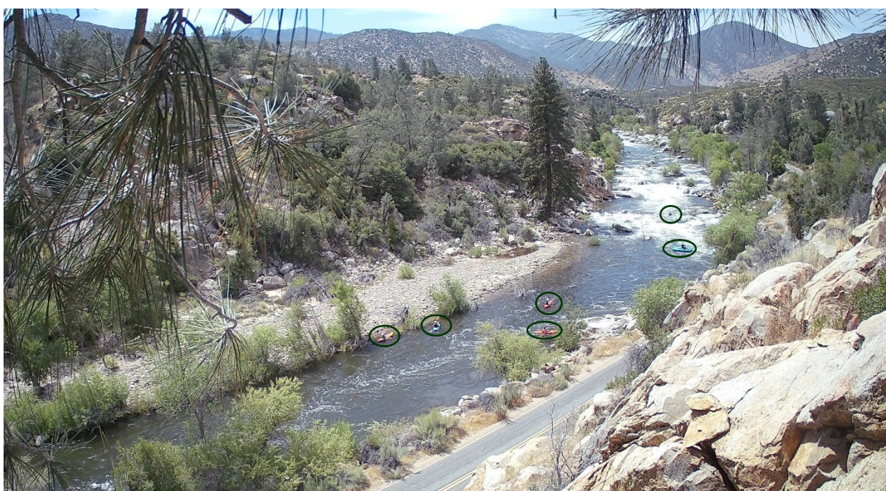
CEYOMUR 100% 2025/05/24 14:45:00 30C 86F CHAMRUN