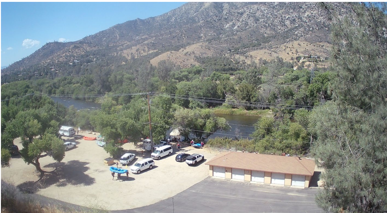
CEYOMJR 100% 2025/06/07 10:30:00 28C 82F KR3PHS2