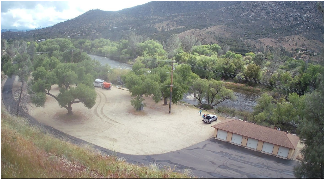
CEYOMJR 100% 2025/04/26 15:30:00 11C 51F KR3PHS2