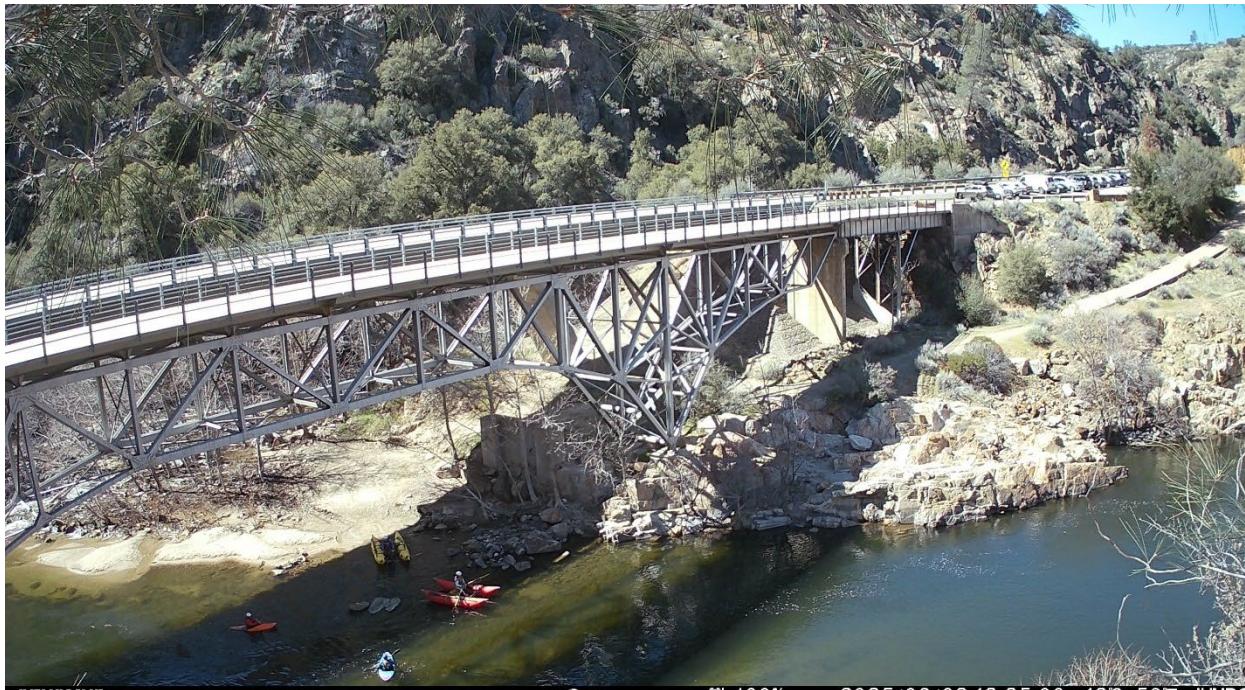
CEYOMUR 100% 2025/03/08 12:25:00 12C 53F JHNBG