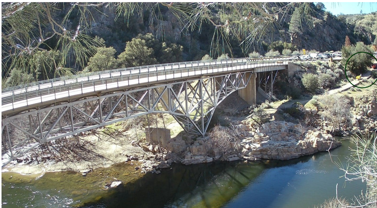
CEYOMUR 100% 2025/03/08 14:15:00 15C 59F JHNBG