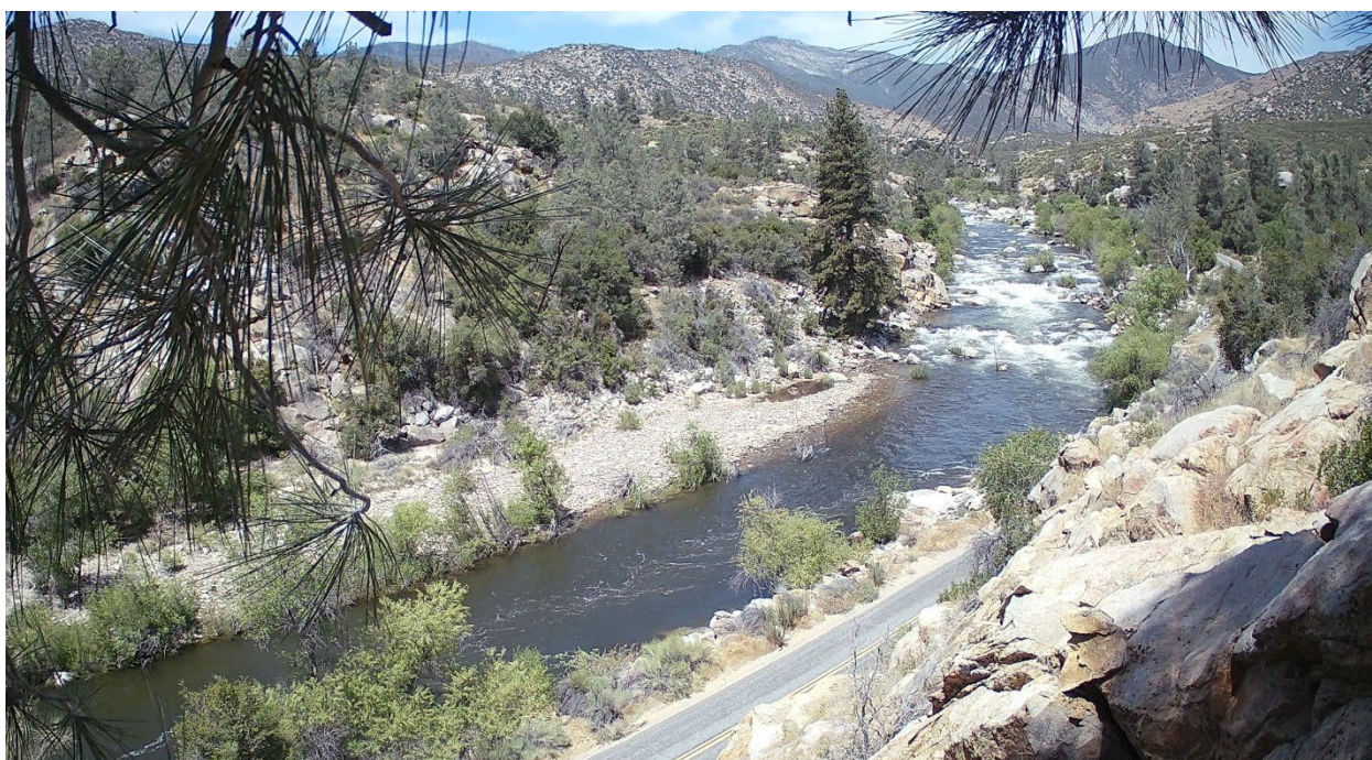
CEYOMUR 100% 2025/05/24 12:00:00 25C 77F CHAMRUN