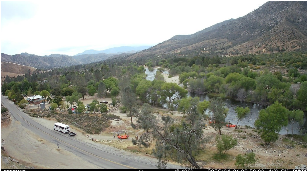
CEYOMUR 100% 2025/04/26 09:50:00 11C 51F RVKRB