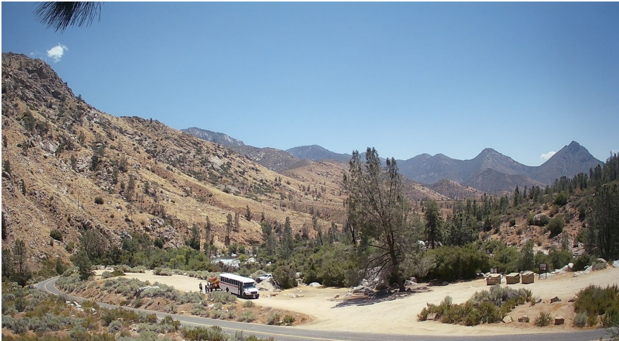
CEYOMUR 100% 2025/06/06 12:55:00 29C 84F ANT