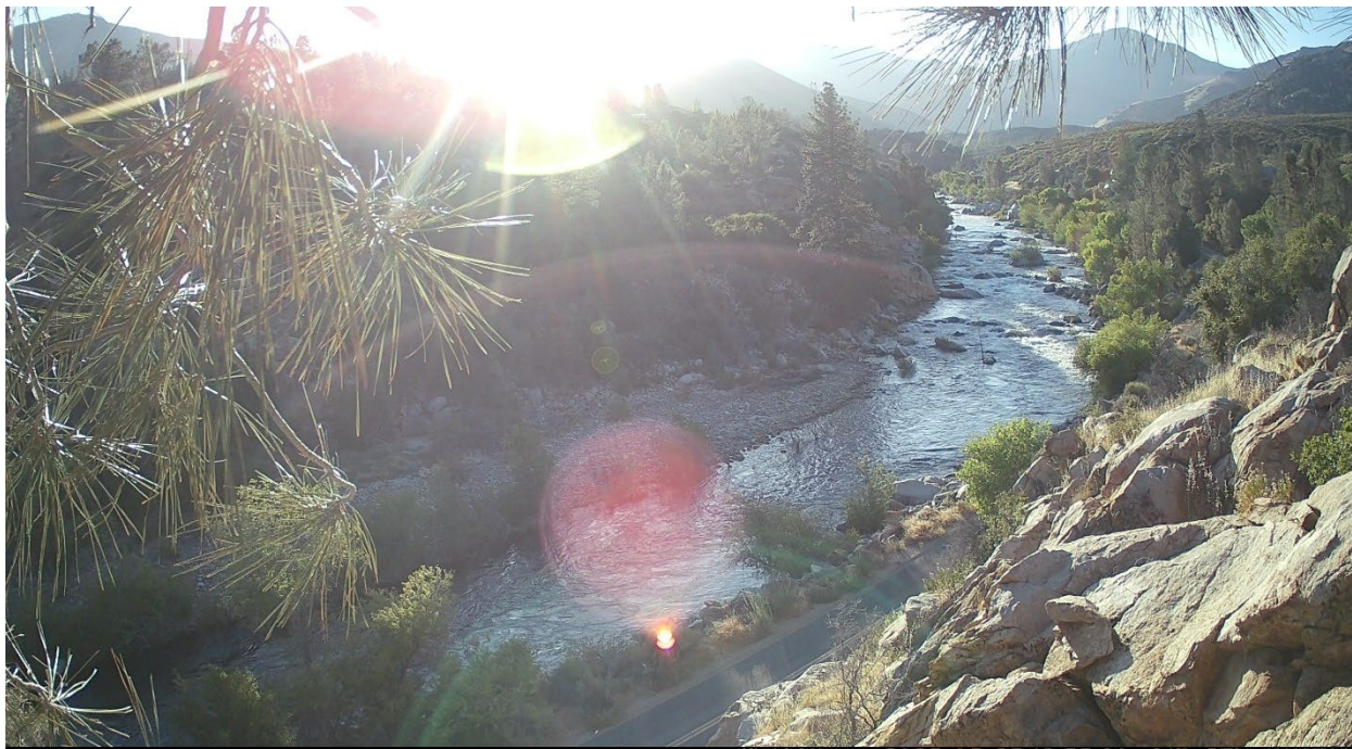
CEYOMUR 100% 2025/05/25 18:55:00 31C 87F CHAMRUN