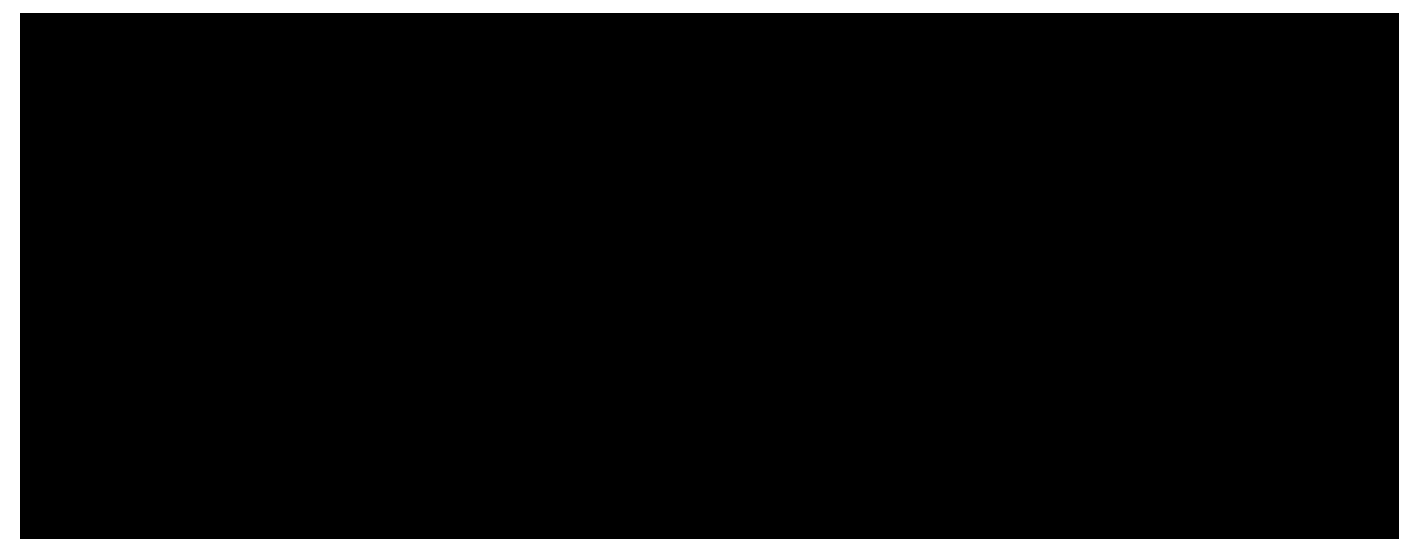
Table C.1: Generating Facility General Information per the IR and/or Attachment B

as disclosed by the IC in its IR and/or Attachment B, as may have been amended during the Interconnection Study process. The facilities are summarized below: