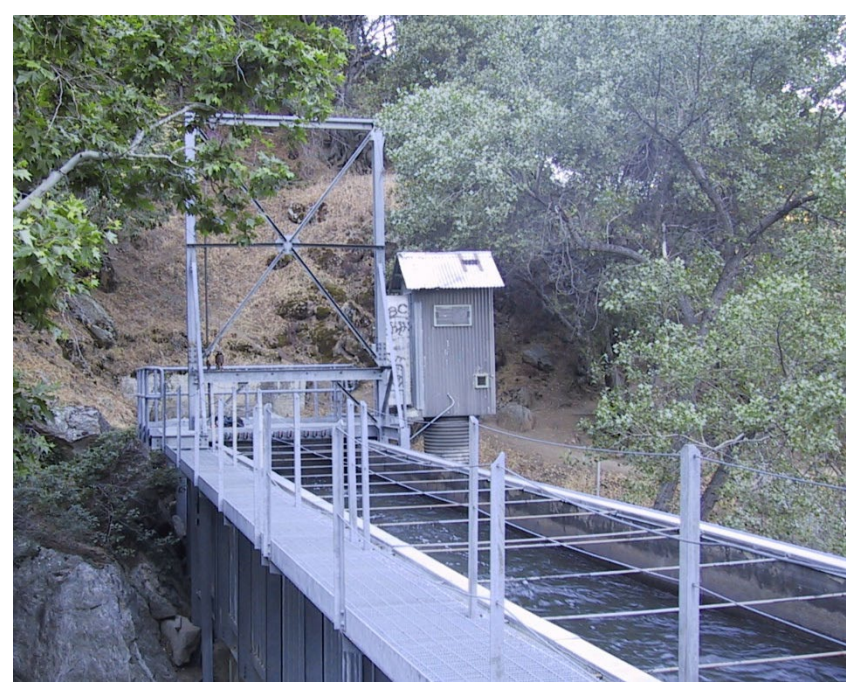
Cow Flat Creek Gage