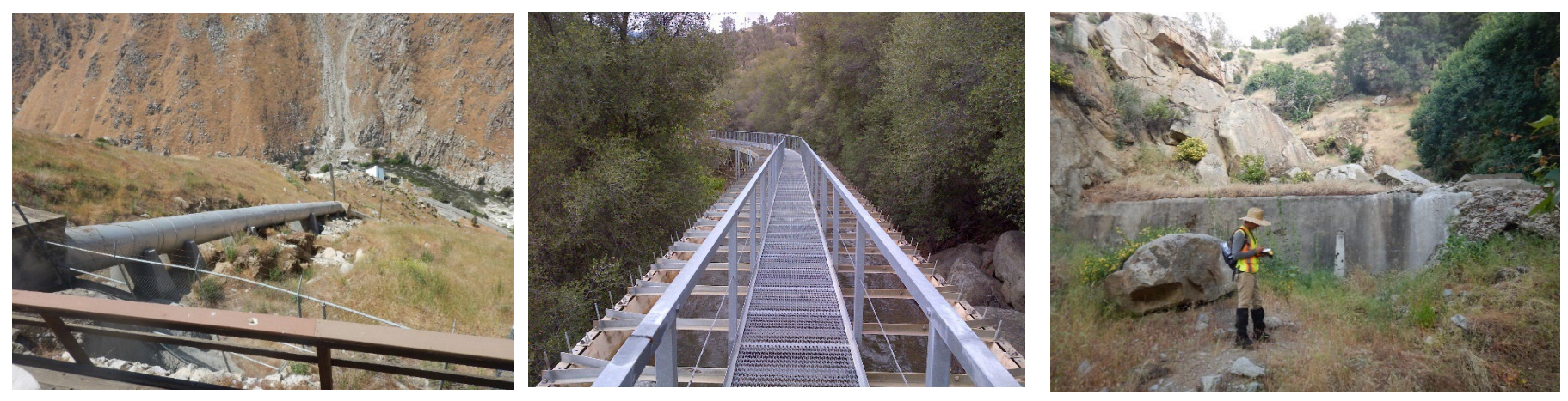
Forebay Spillway Pipe