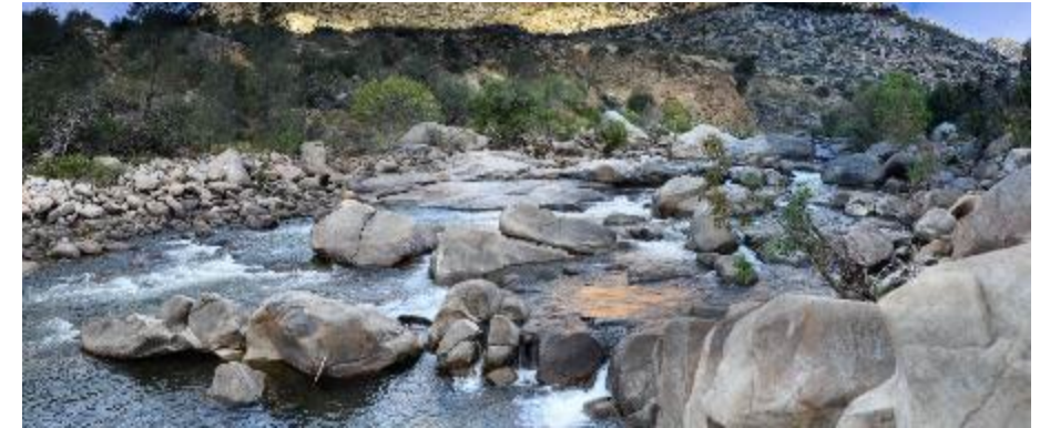
September 19, 2023: 134–160 cfs flow range