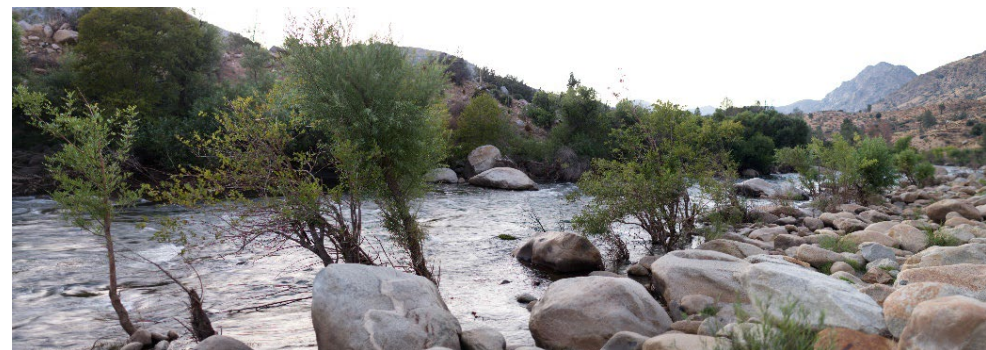
August 27, 2023: 719–829 cfs flow range