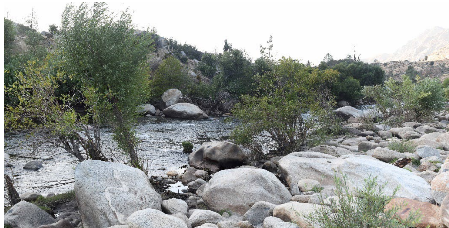
September 6, 2023: 331–381 cfs flow range