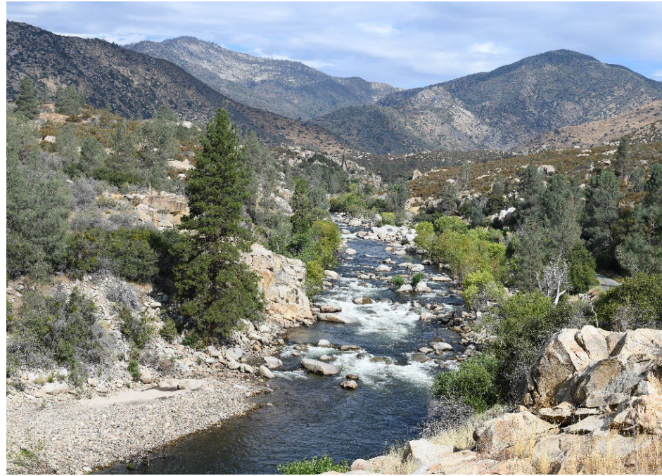
August 9, 2023: 891–1,000 cfs flow range