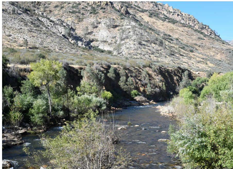
September 6, 2023: 331–381 cfs flow range