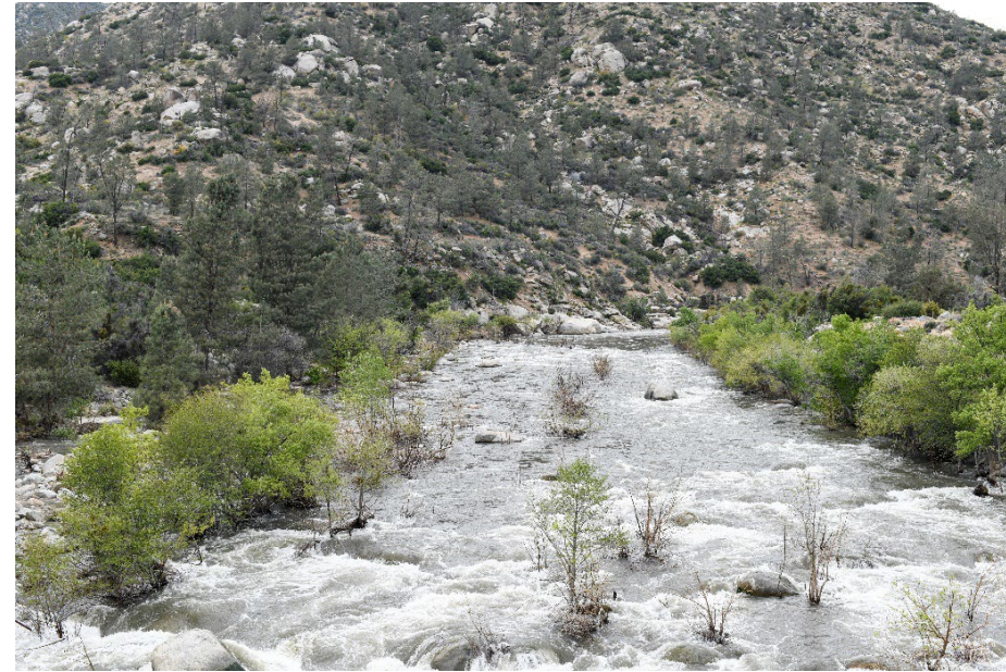
May 9, 2023: 3,676–3,874 cfs flow range