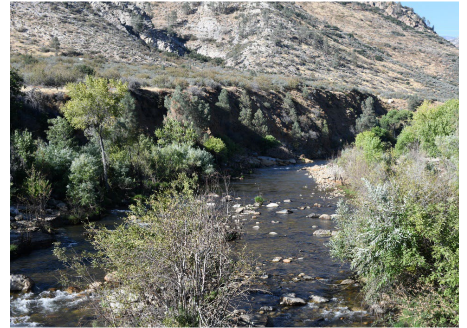
September 18, 2023: 134–160 cfs flow range