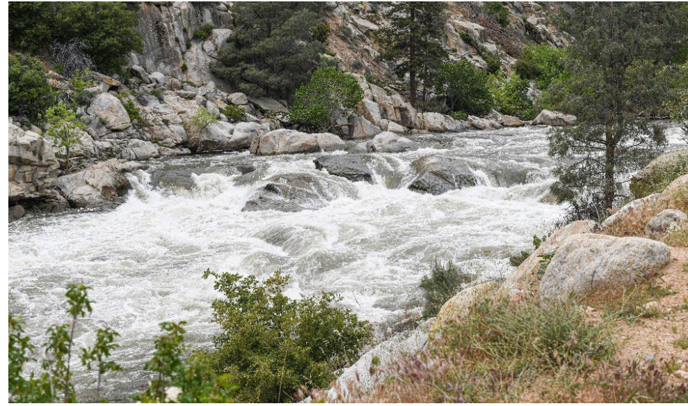
May 9, 2023: 3,676–3,874 cfs flow range