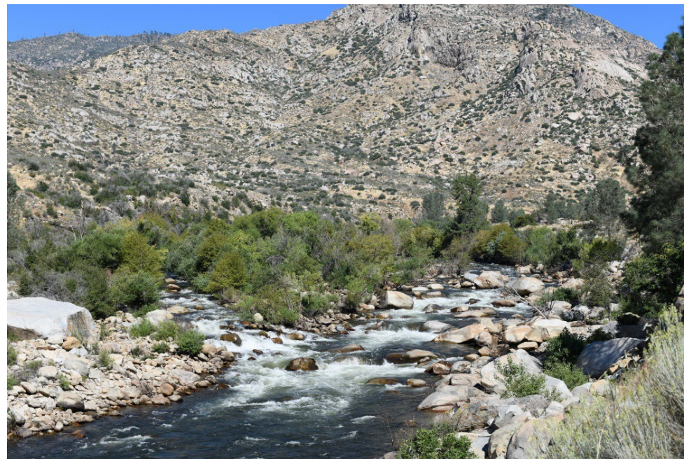
August 28, 2023: 719–829 cfs flow range