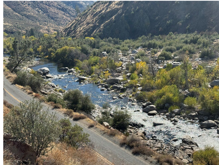
October 23, 2025: 91 cfs flow