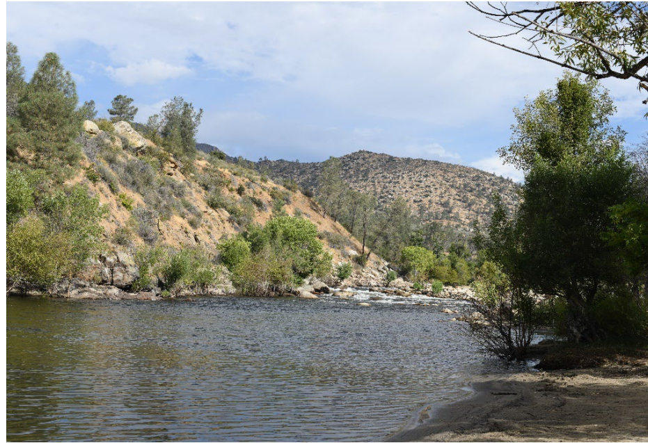
August 10, 2023: 891–1,000 cfs flow range