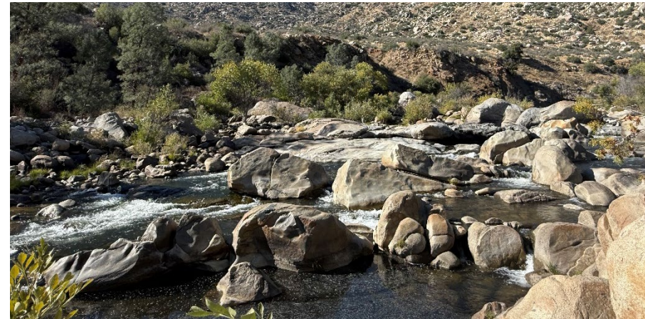
October 23, 2025: 91 cfs flow