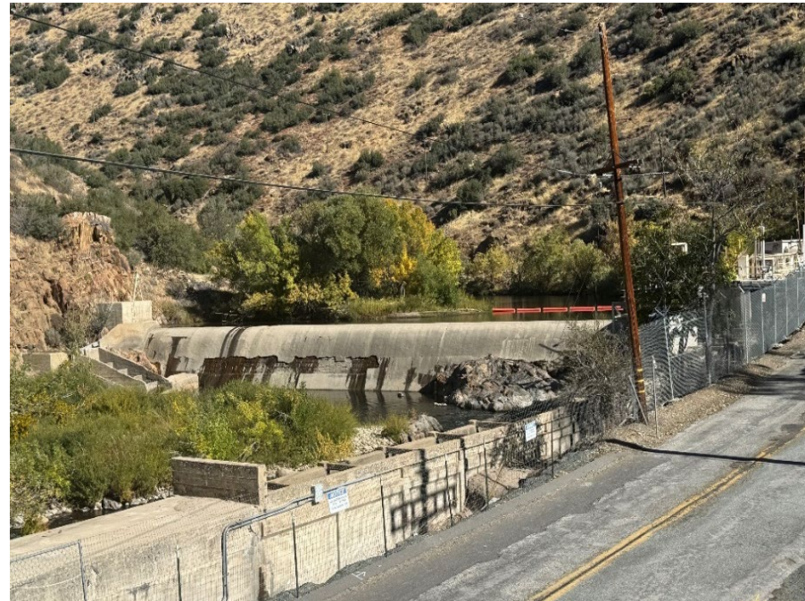
October 23, 2025: 91 cfs flow