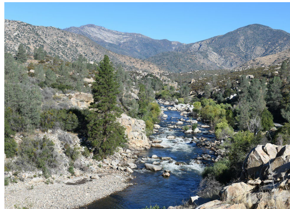
August 28, 2023: 719–829 cfs flow range