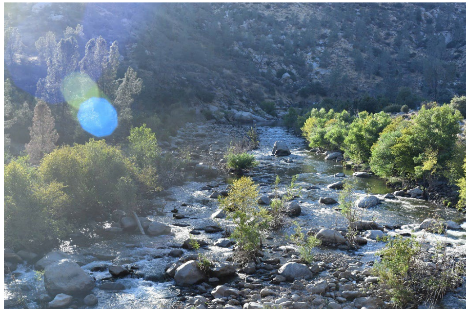
September 6, 2023: 331–381 cfs flow range