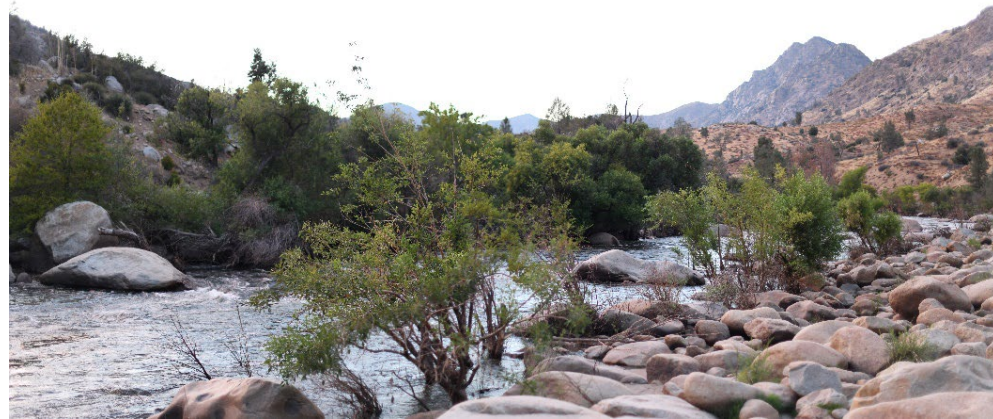
August 9, 2023: 891–1,000 cfs flow range