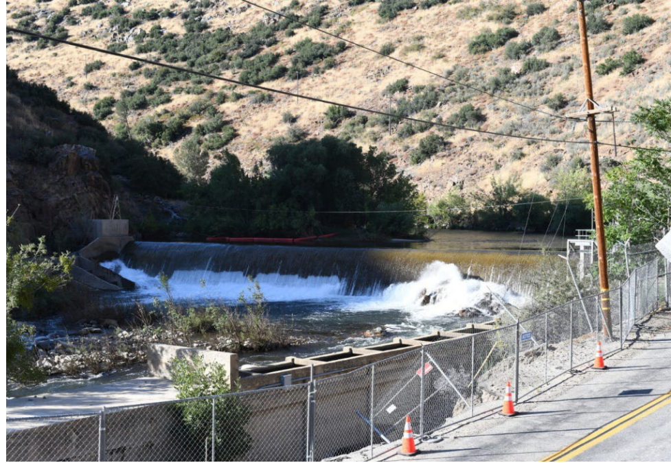
August 9, 2023: 891–1,000 cfs flow range