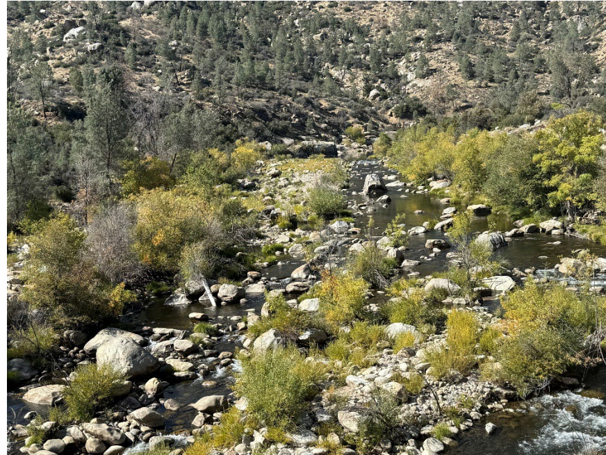
October 23, 2025: 91 cfs flow