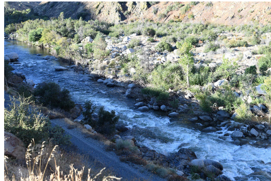
August 28, 2023: 719–829 cfs flow range