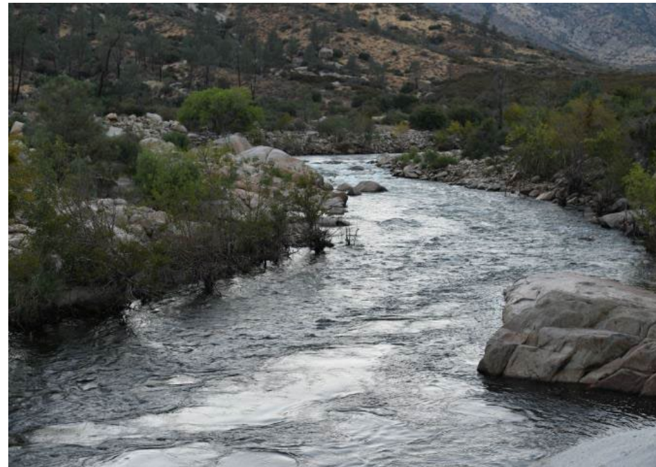
August 27, 2023: 719–829 cfs flow range