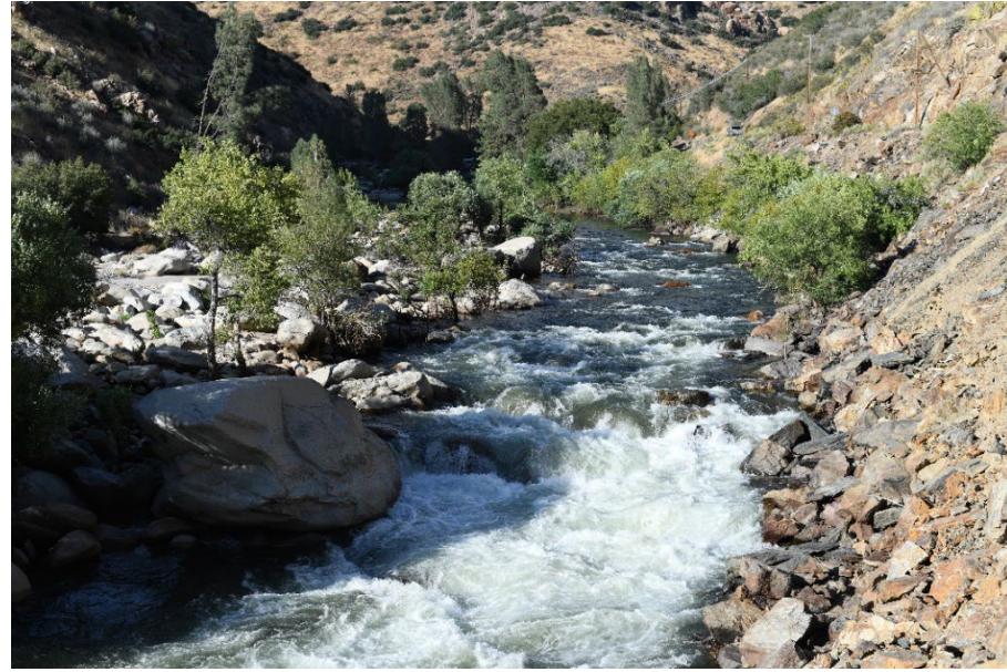
August 9, 2023: 891–1,000 cfs flow range