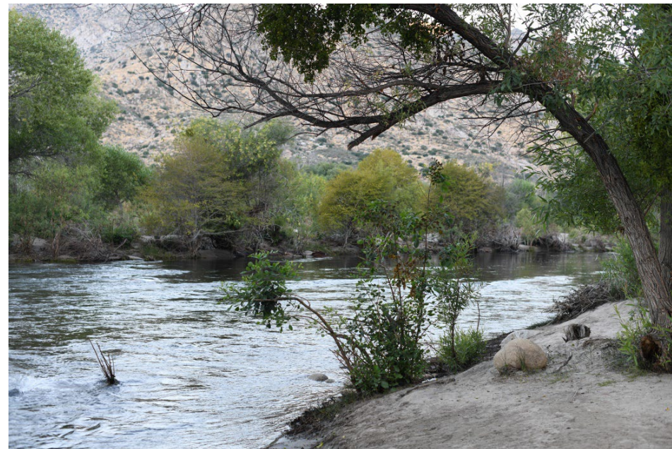
August 28, 2023: 719–829 cfs flow range