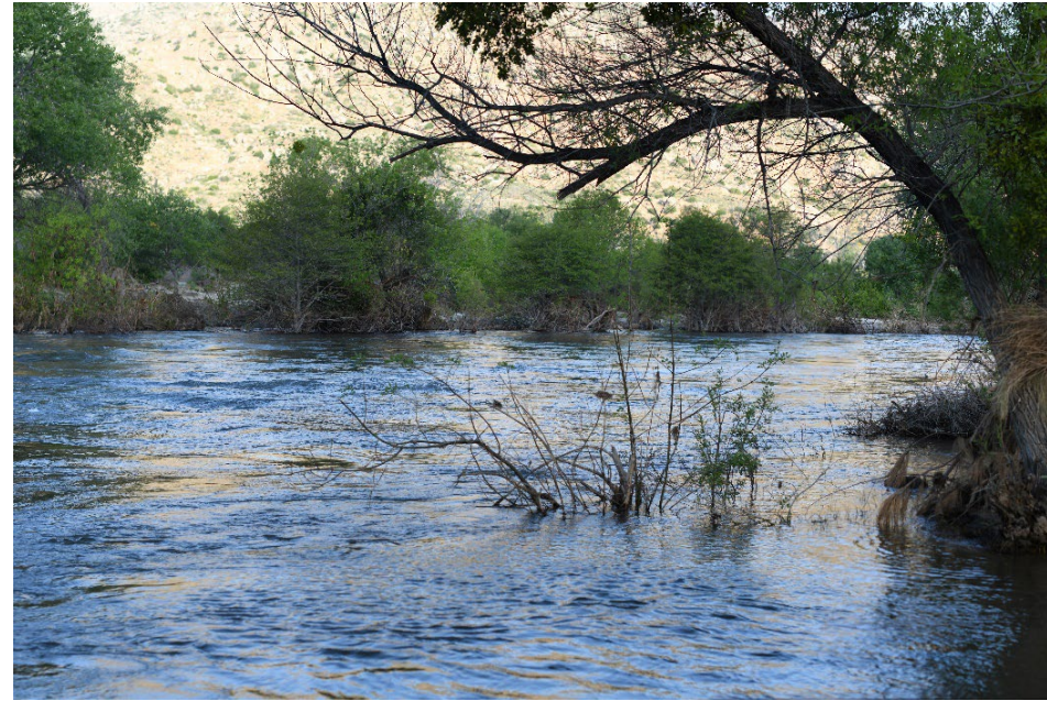
May 9, 2023: 3,676–3,874 cfs flow range