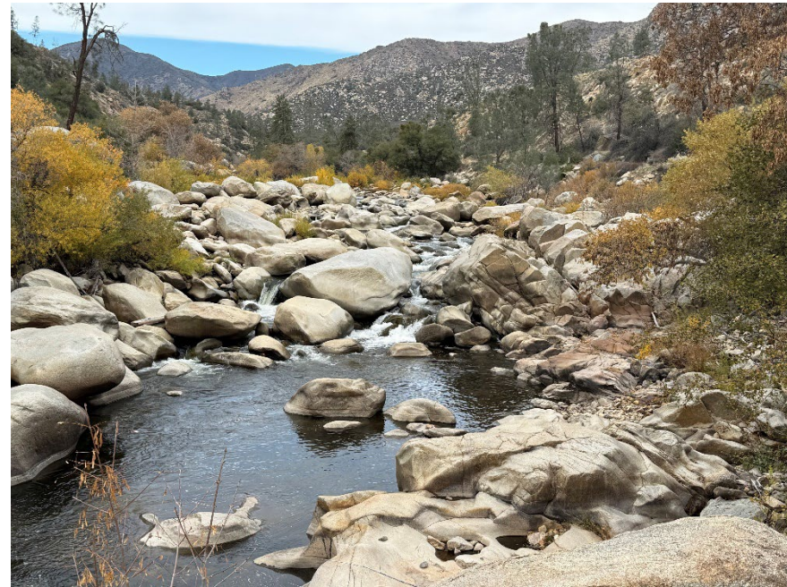
December 2, 2025: 52 cfs flow