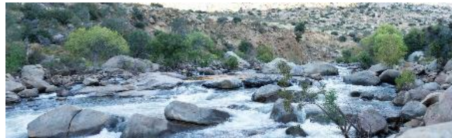
August 28, 2023: 719–829 cfs flow range