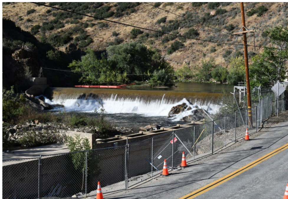
September 6, 2023: 331–381 cfs flow range