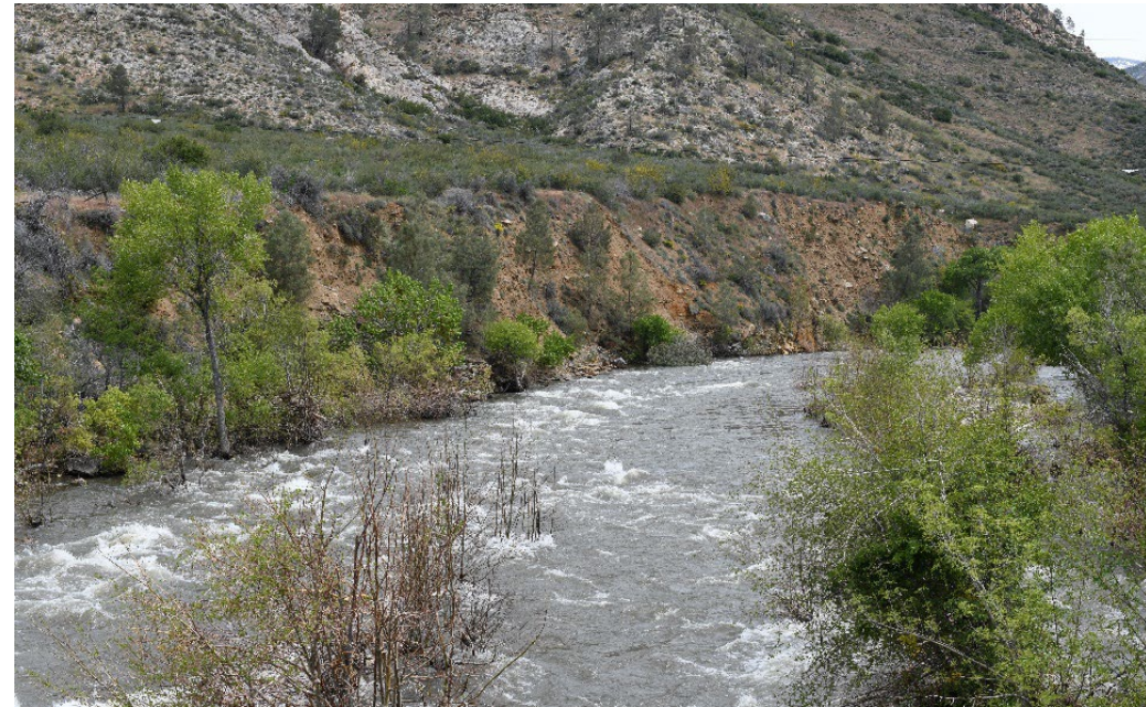
May 9, 2023: 3,676–3,874 cfs flow range