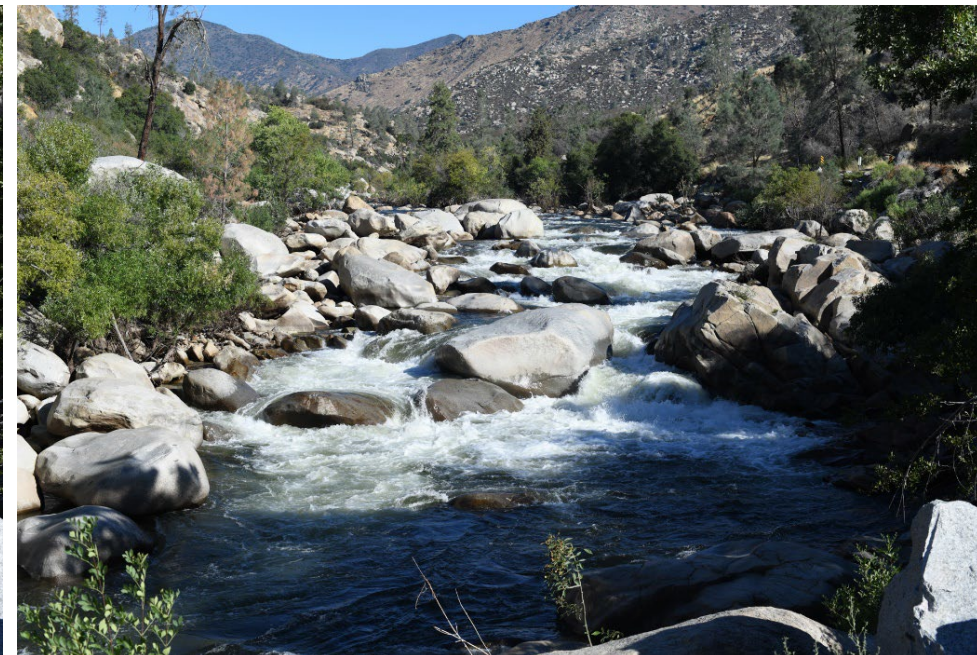
August 28, 2023: 719–829 cfs flow range