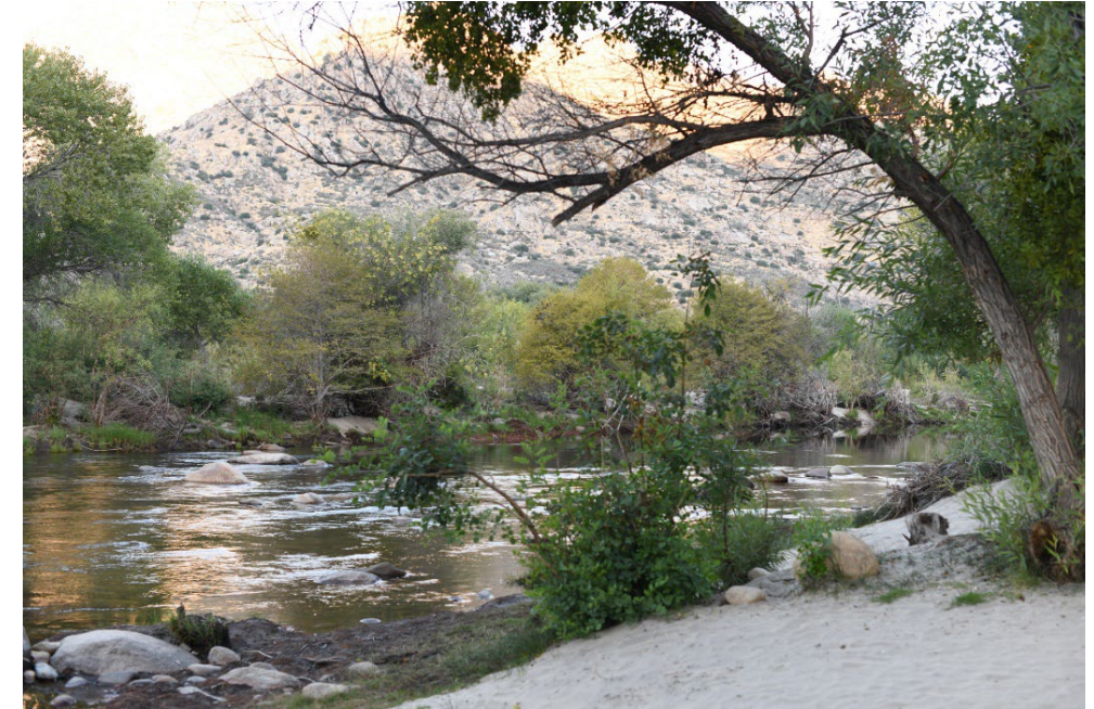
September 19, 2023: 134–160 cfs flow range