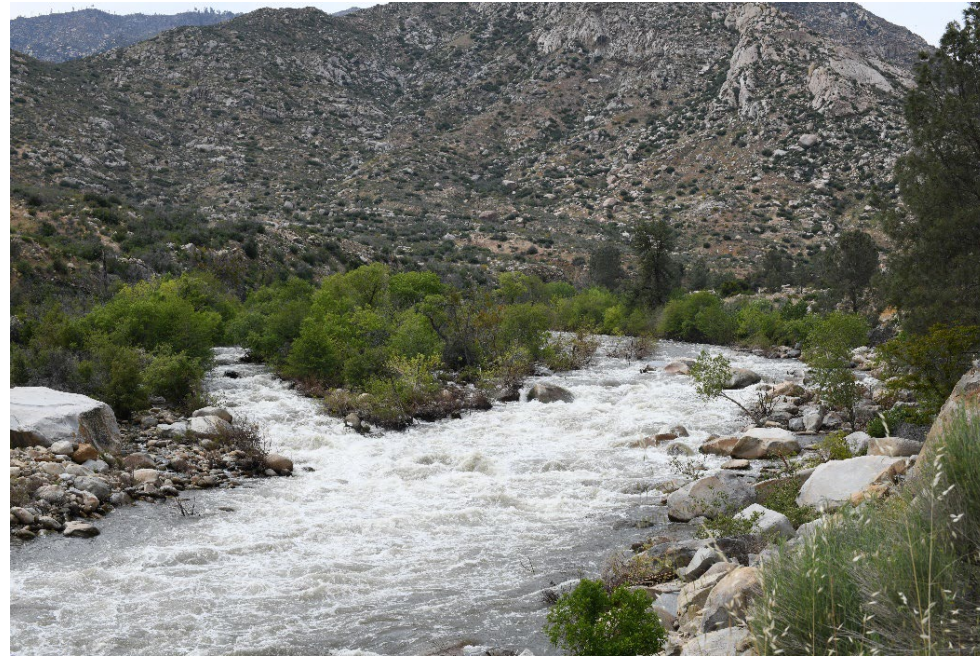
May 9, 2023: 3,676–3,874 cfs flow range