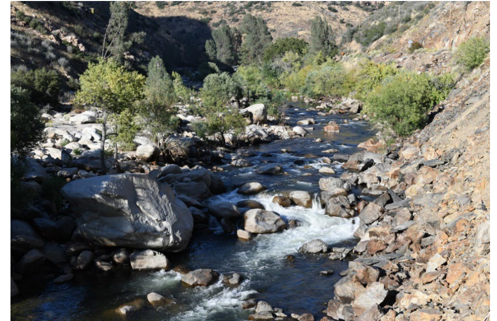
September 18, 2023: 134–160 cfs flow range