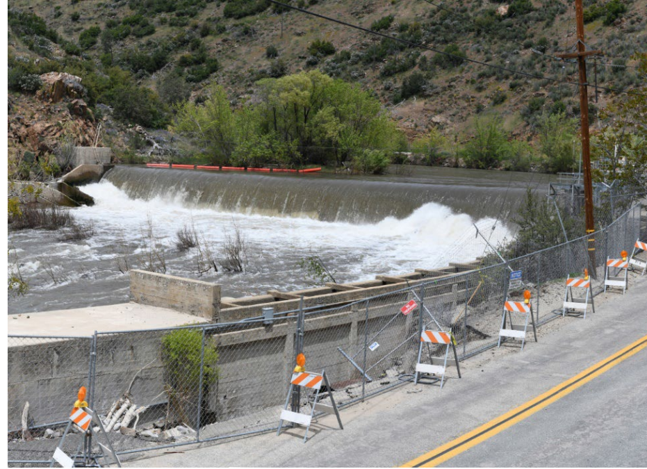
May 9, 2023: 3,676–3,874 cfs flow range