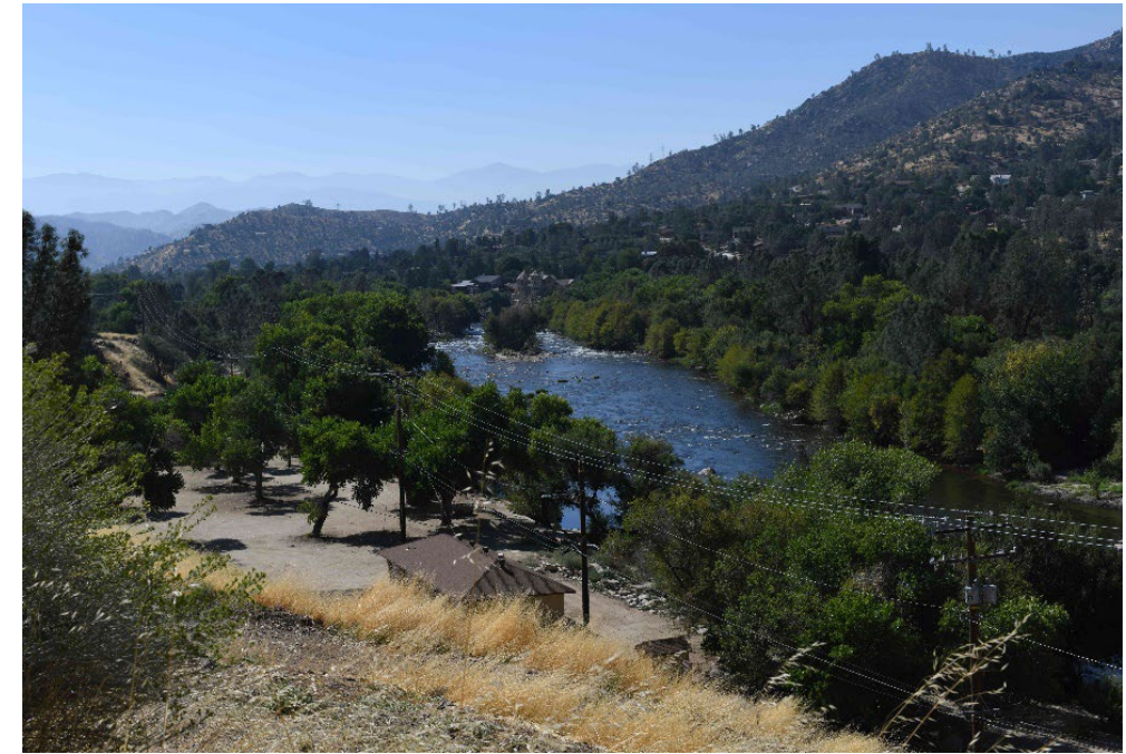
September 19, 2023: 701 cfs flow range