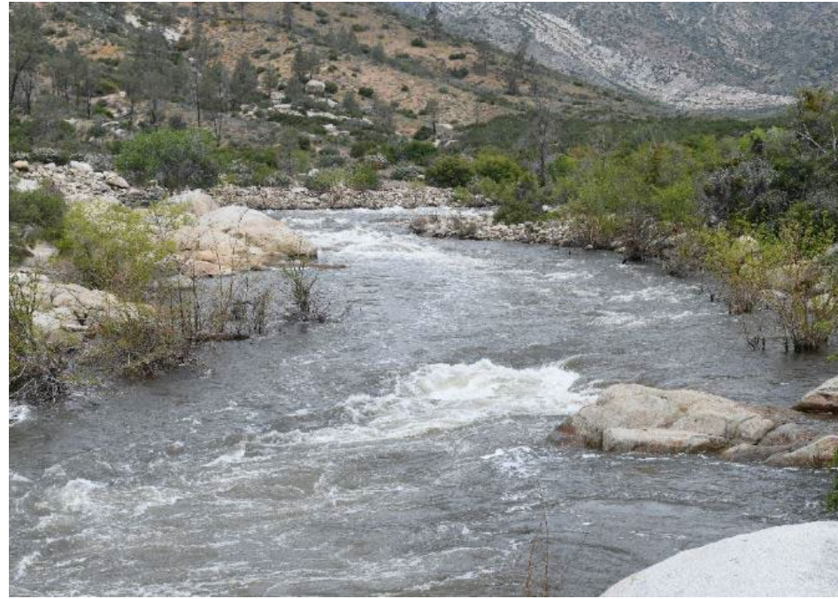
May 9, 2023: 3,676–3,874 cfs flow range