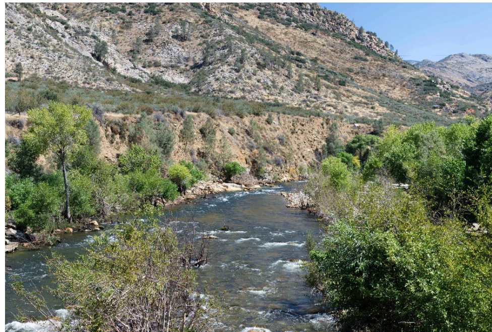
August 28, 2023: 719–829 cfs flow range