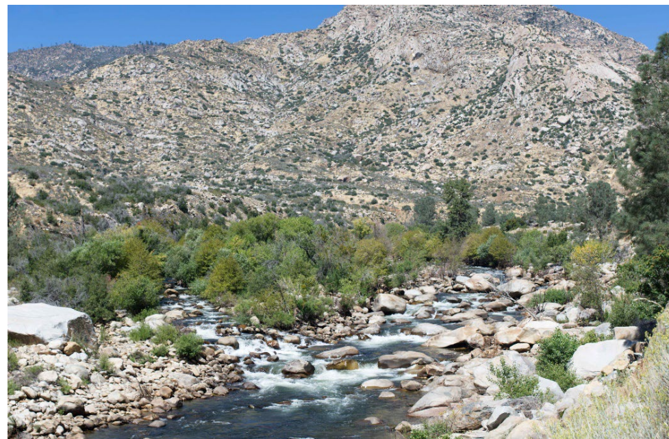
September 7, 2023: 331–381 cfs flow range