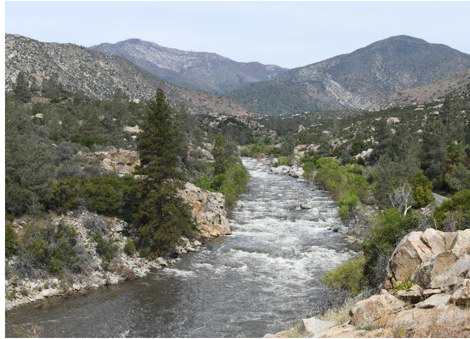
May 9, 2023: 3,676–3,874 cfs flow range