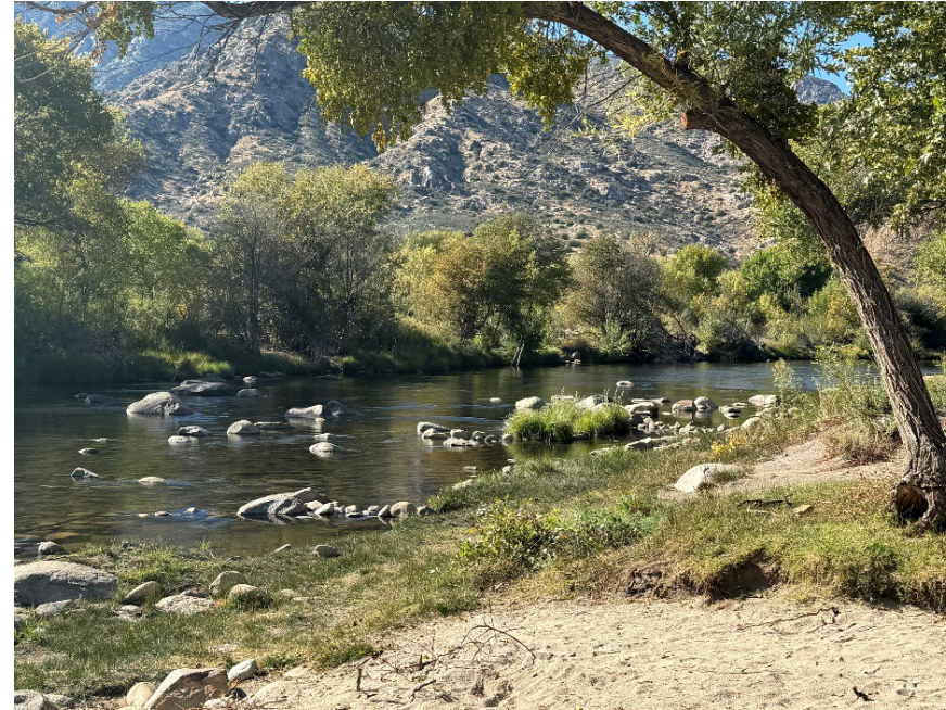
October 23, 2025: 91 cfs flow