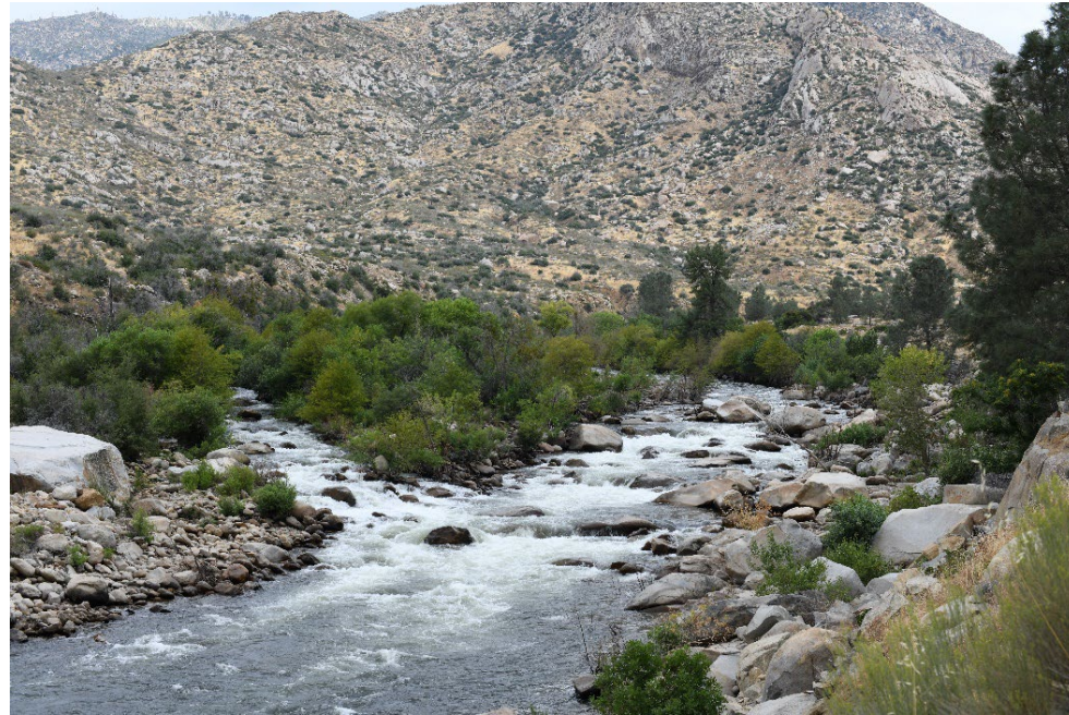
August 10, 2023: 891–1,000 cfs flow range