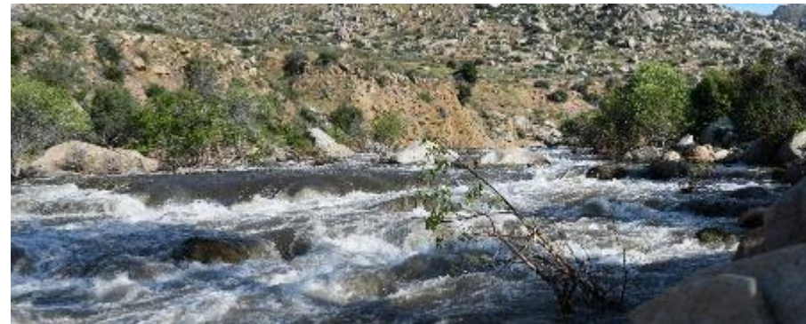
May 9, 2023: 3,676–3,874 cfs flow range