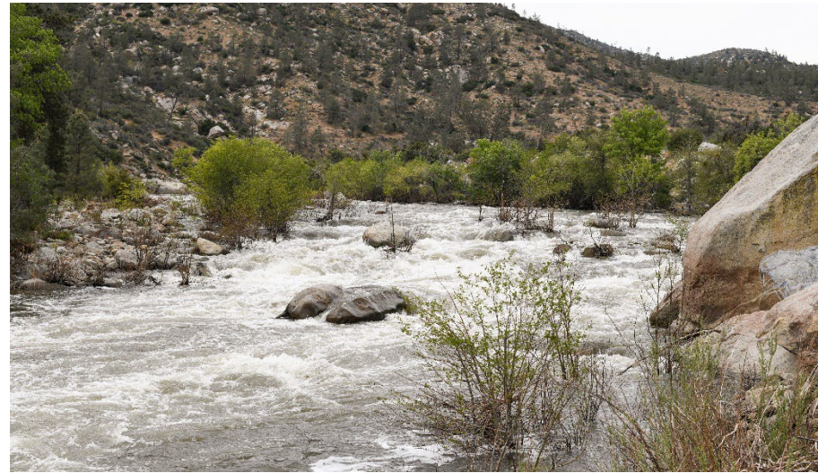
May 9, 2023: 3,676–3,874 cfs flow range