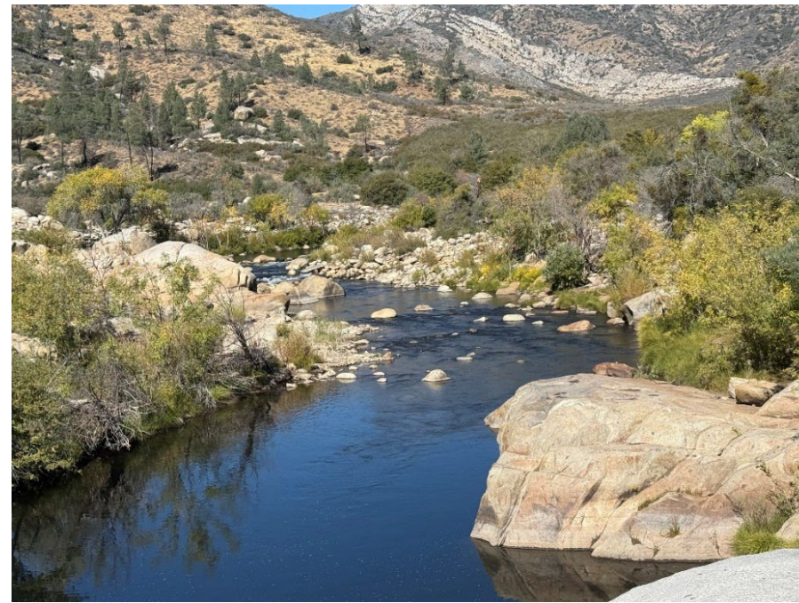
October 23, 2025: 91 cfs flow