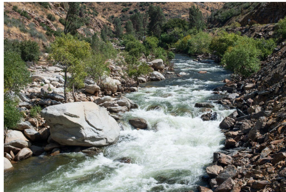
August 28, 2023: 719–829 cfs flow range