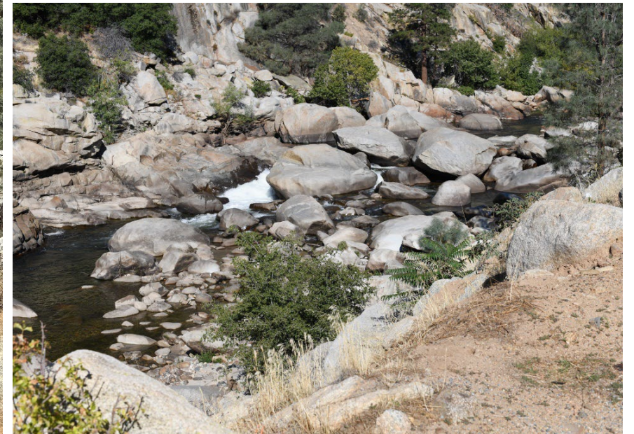
September 19, 2023: 134–160 cfs flow range