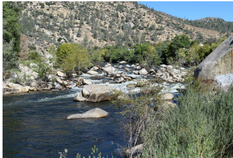
August 28, 2023: 719–829 cfs flow range