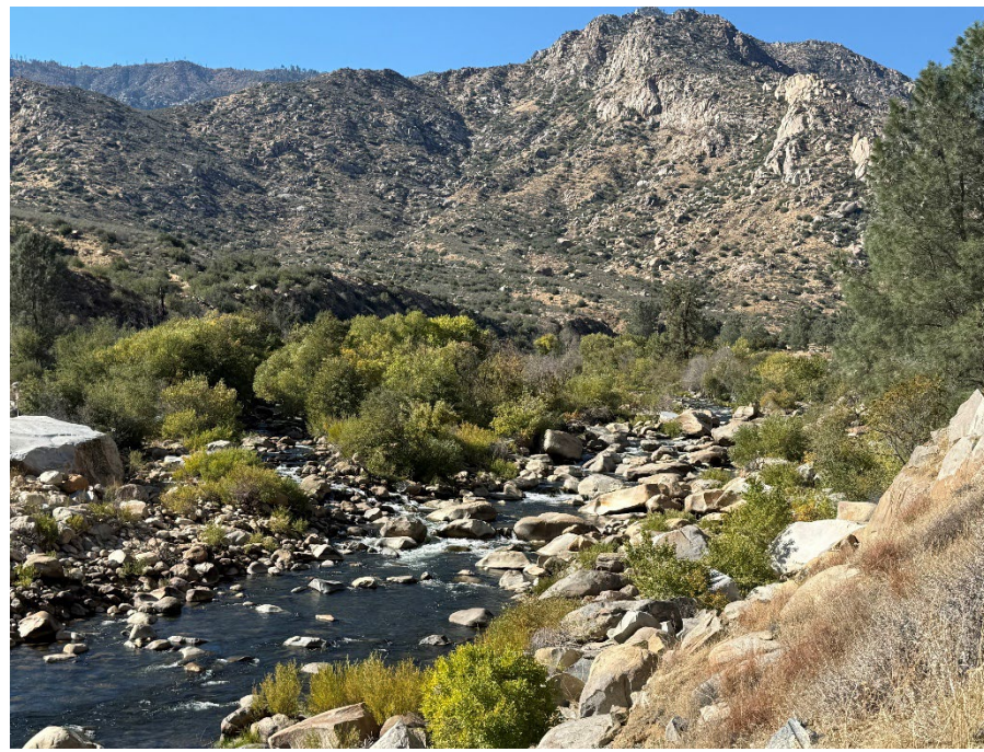
October 23, 2025: 91 cfs flow