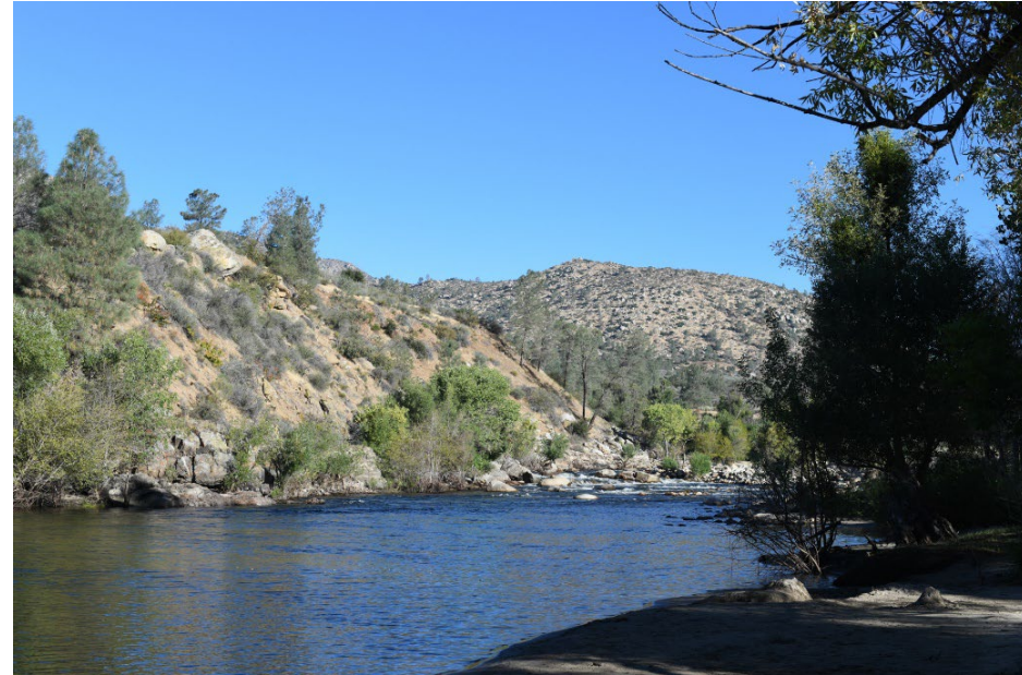
August 28, 2023: 719–829 cfs flow range