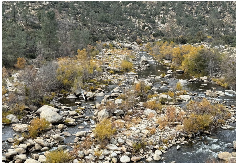
December 2, 2025: 52 cfs flow