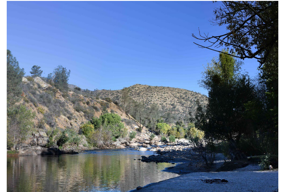
September 19, 2023: 134–160 cfs flow range