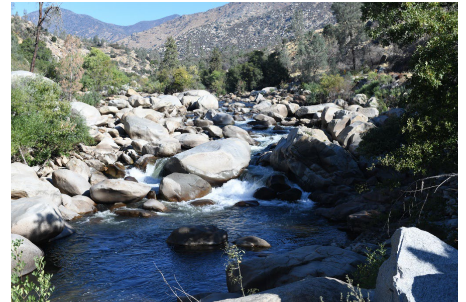
September 19, 2023: 134–160 cfs flow range