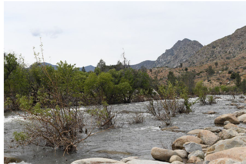
May 9, 2023: 3,676–3,874 cfs flow range