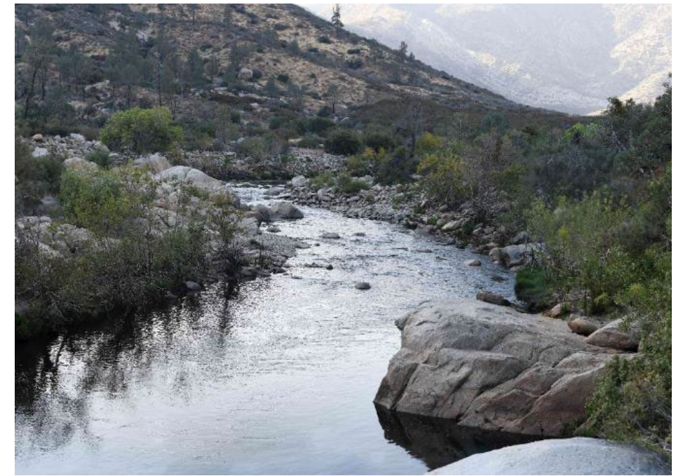
September 18, 2023: 134–160 cfs flow range