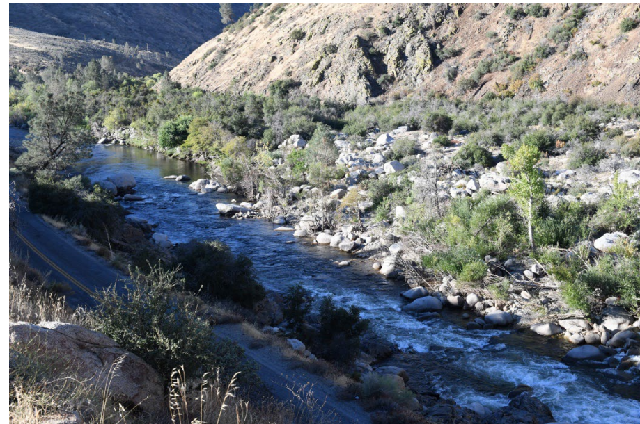
September 7, 2023: 331–381 cfs flow range