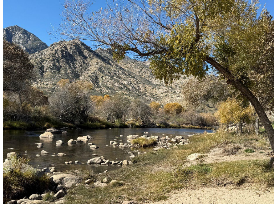
December 2, 2025: 52 cfs flow