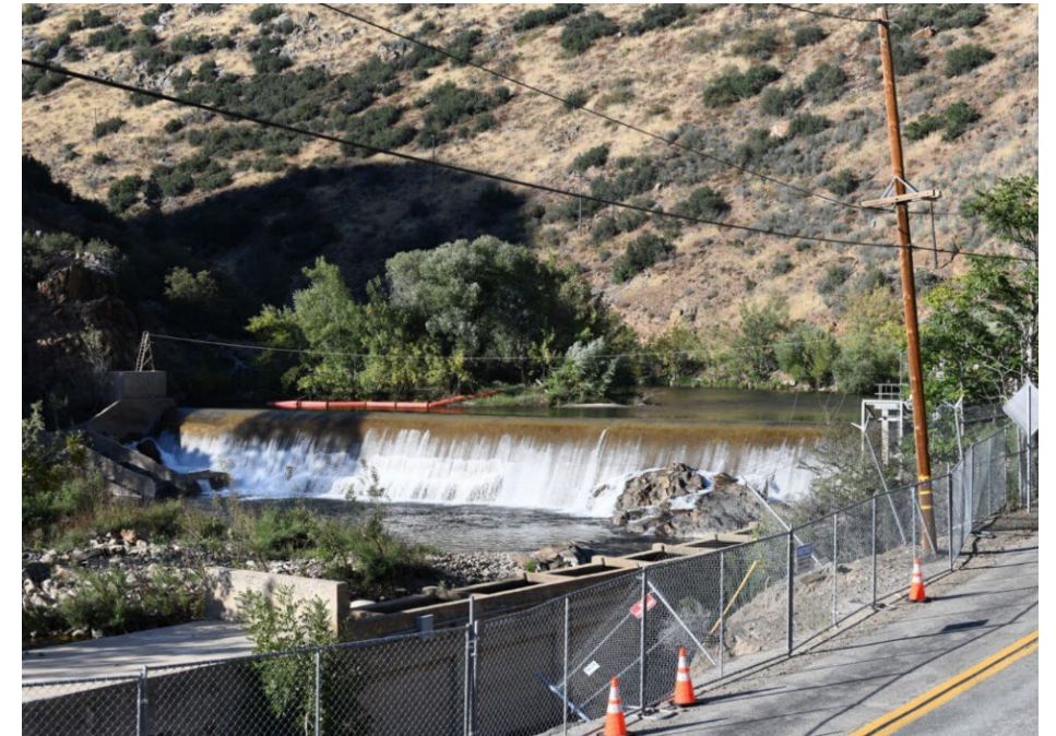
September 18, 2023: 134–160 cfs flow range