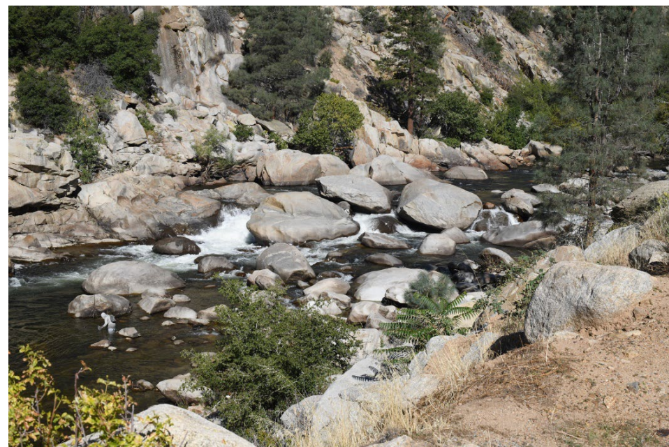
September 7, 2023: 331–381 cfs flow range