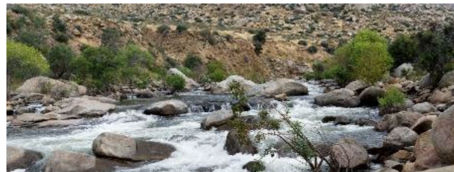
August 10, 2023: 891–1,000 cfs flow range