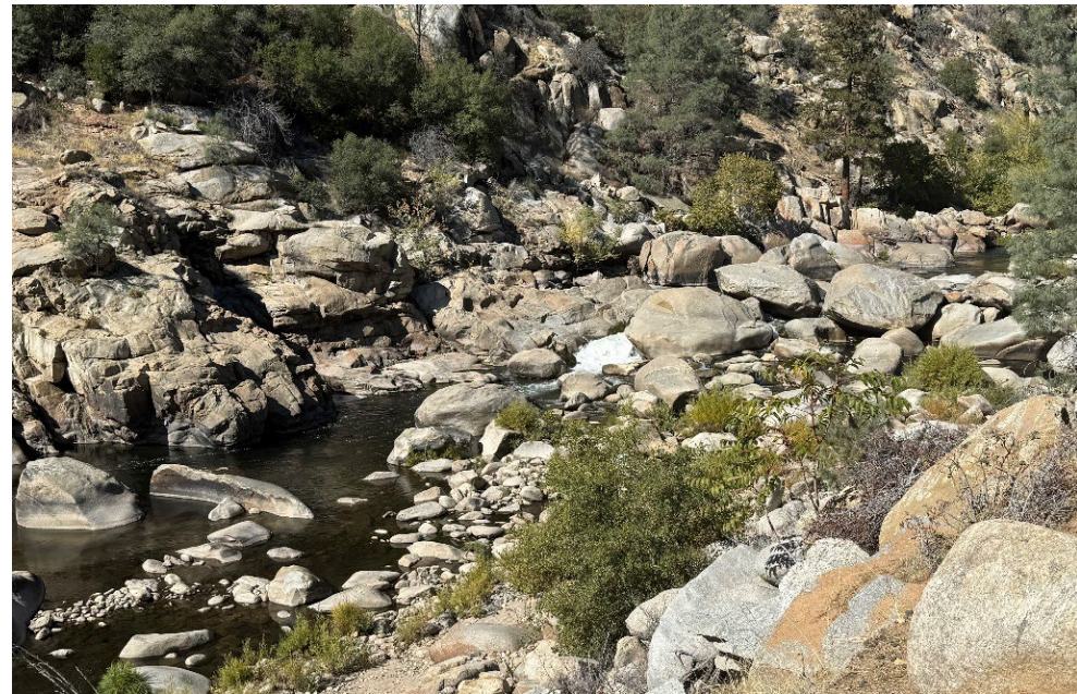
October 23, 2025: 91 cfs flow