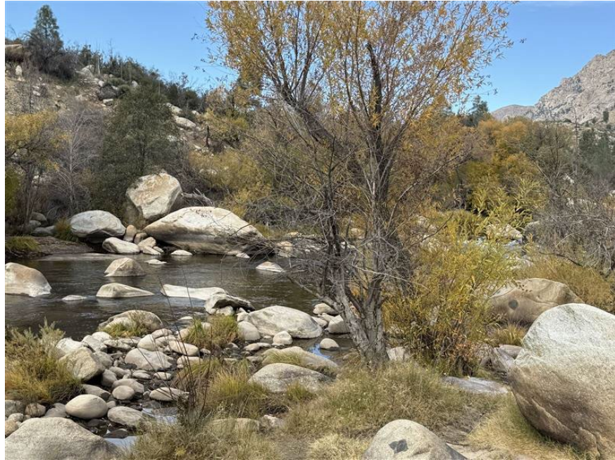
December 2, 2025: 52 cfs flow