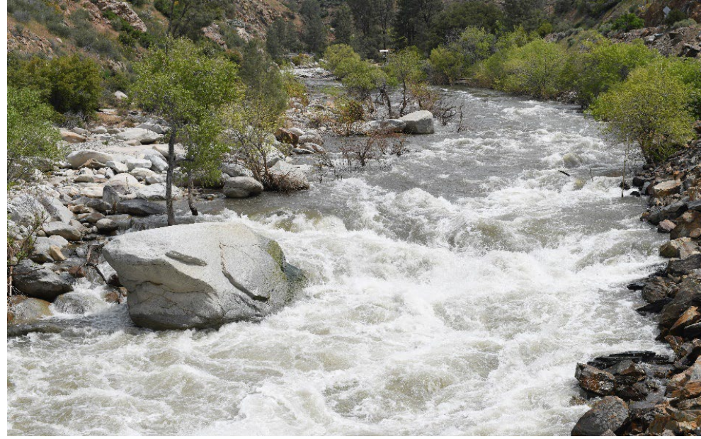
May 9, 2023: 3,676–3,874 cfs flow range