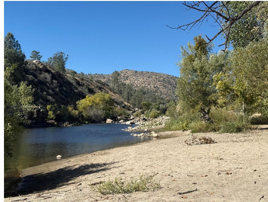
October 23, 2025: 91 cfs flow