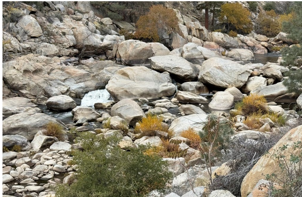
December 2, 2025: 52 cfs flow