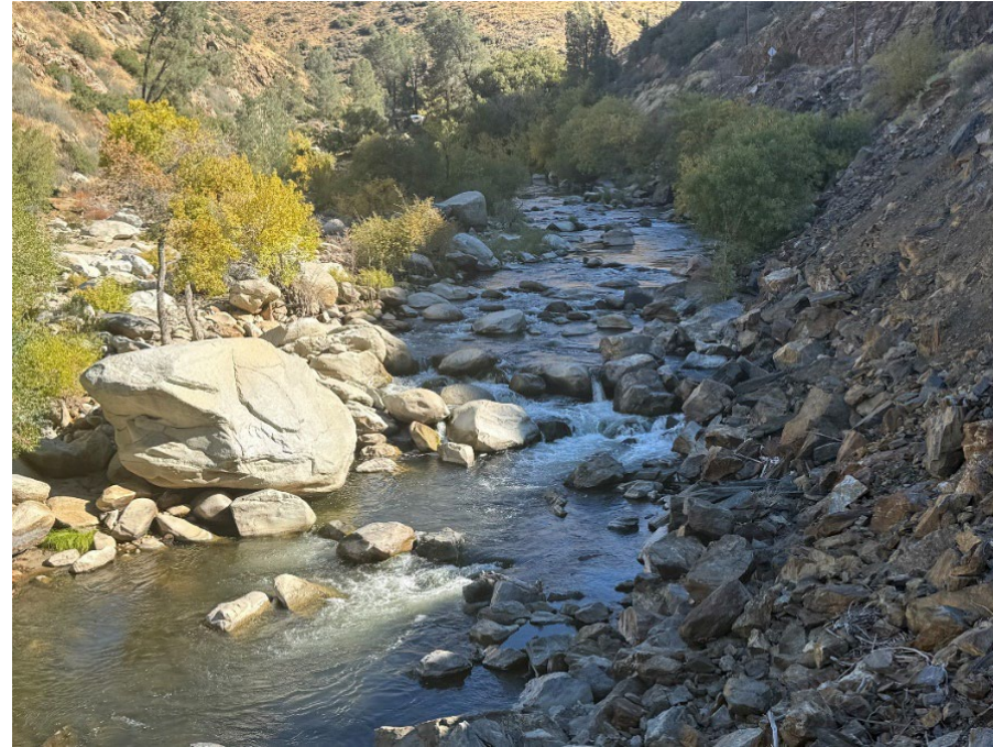
October 25, 2025, 91 cfs flow