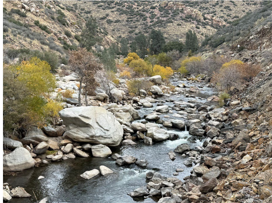
December 2, 2025: 52 cfs flow