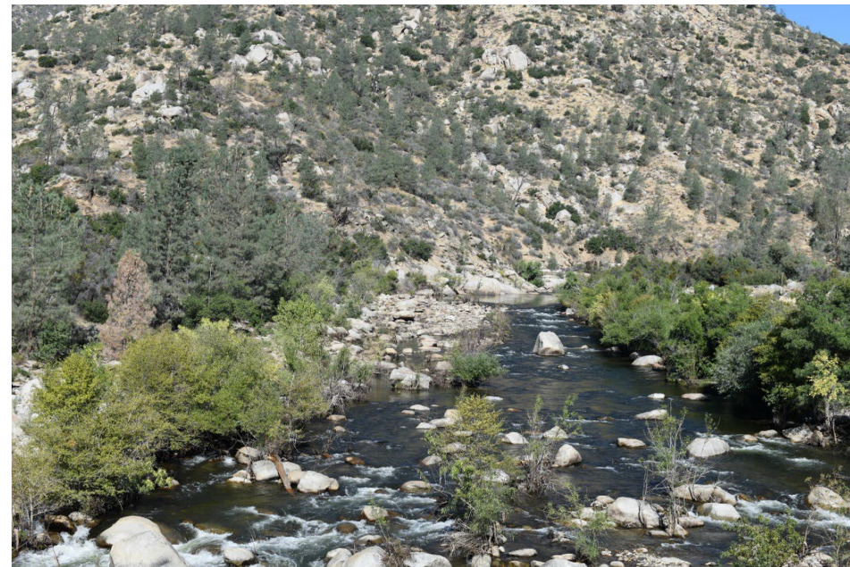
August 28, 2023: 719–829 cfs flow range