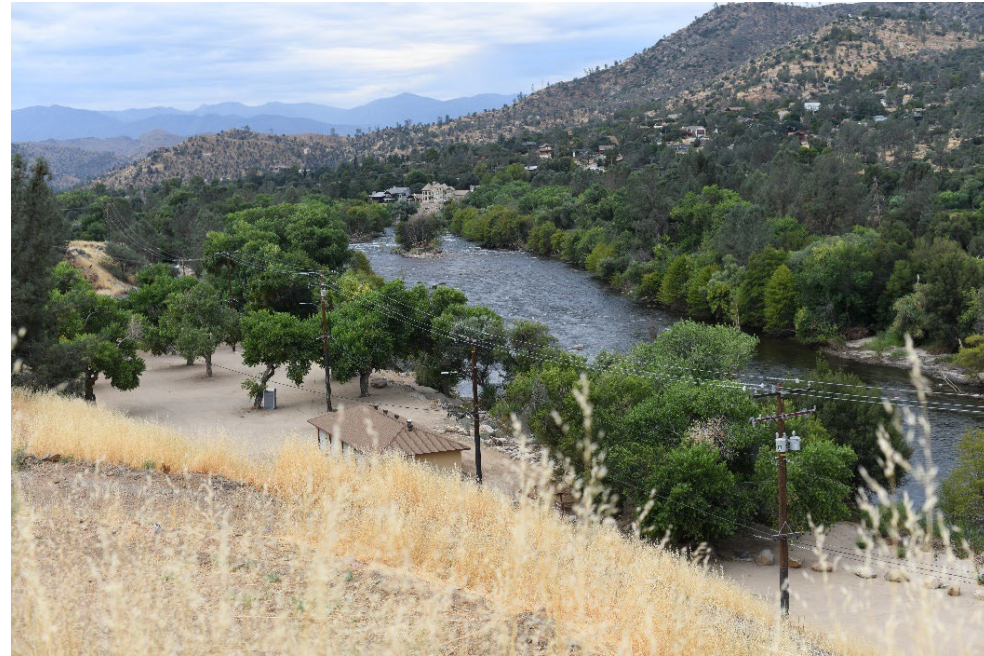
August 10, 2023: 1,469 cfs flow range