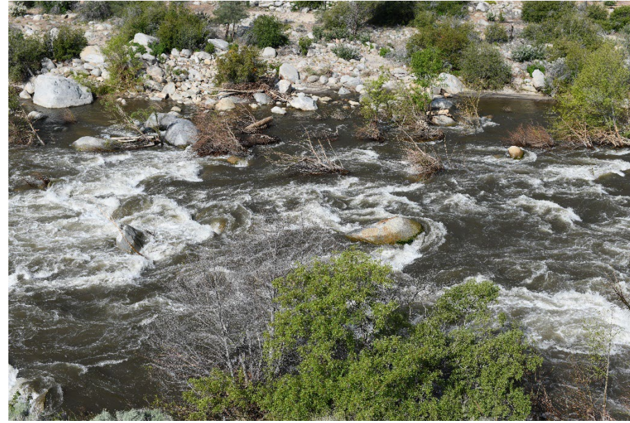
May 9, 2023: 3,676–3,874 cfs flow range