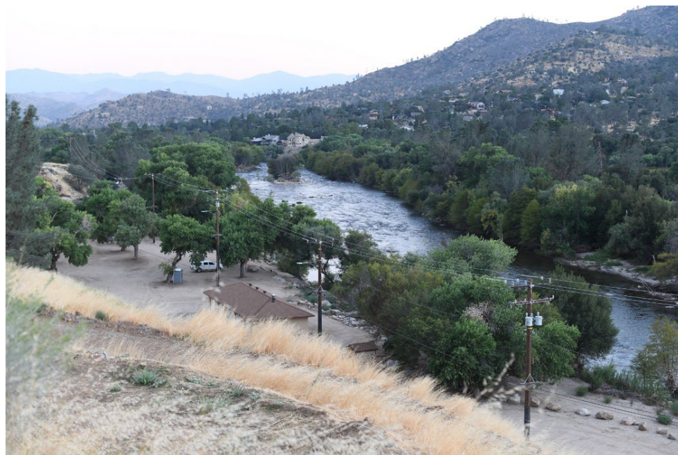
September 7, 2023: 900 cfs flow range