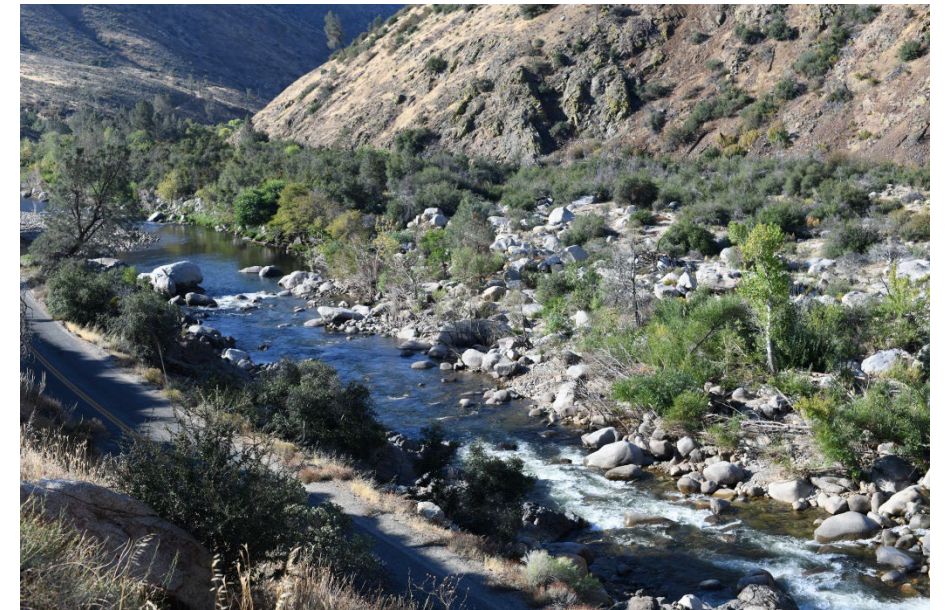
September 19, 2023: 134–160 cfs flow range