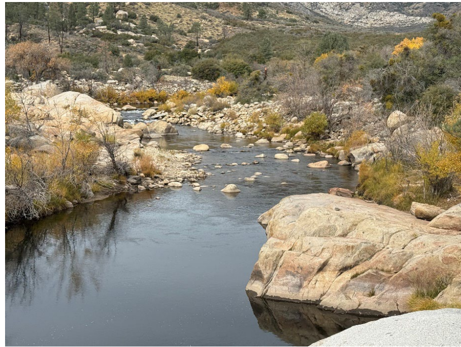
December 2, 2025: 52 cfs flow