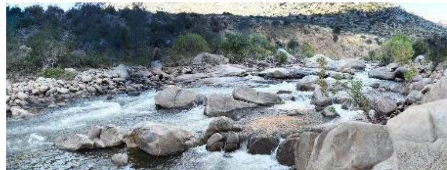
September 7, 2023: 331–381 cfs flow range