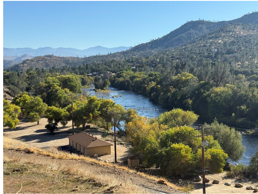
October 23, 2025: 342 cfs flow