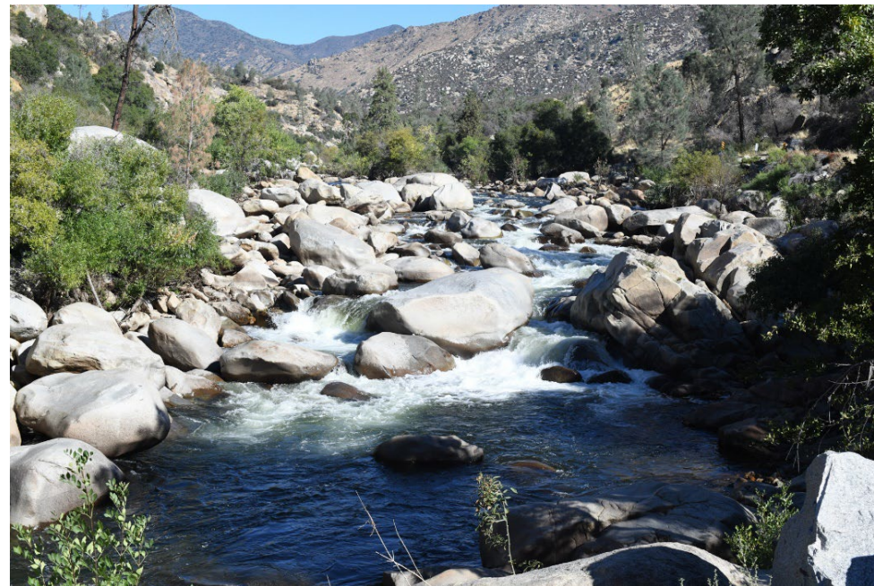
September 7, 2023: 331–381 cfs flow range