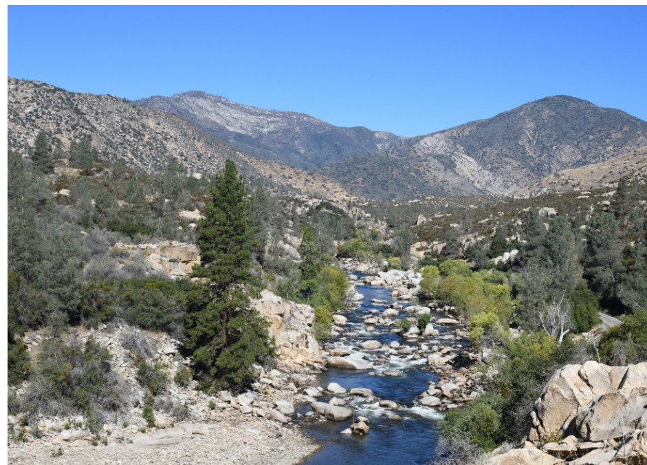
September 7, 2023: 331–381 cfs flow range