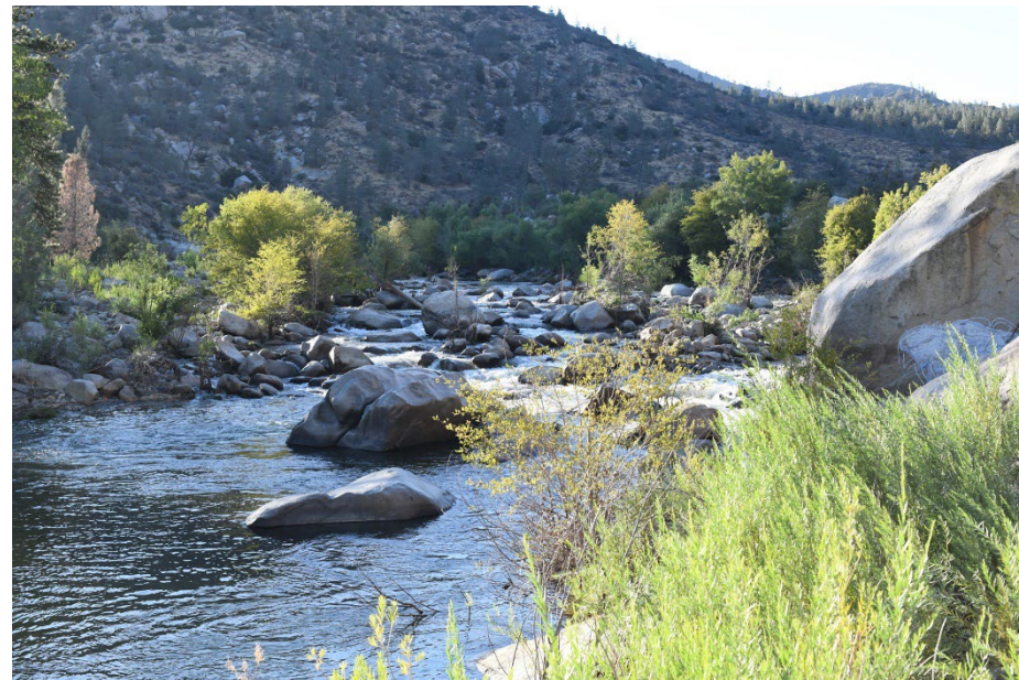
September 6, 2023: 331–381 cfs flow range