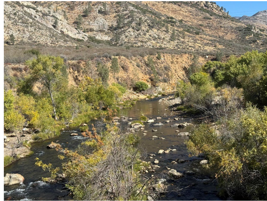
October 23, 2025: 91 cfs flow