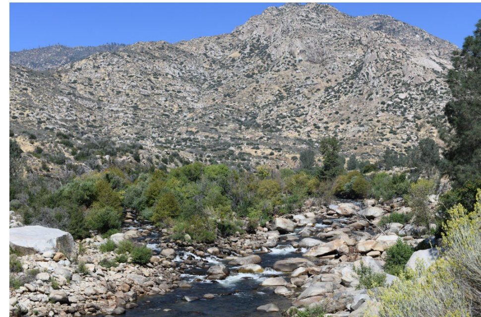
September 19, 2023: 134–160 cfs flow range