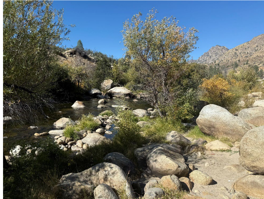
October 23, 2025: 91 cfs flow