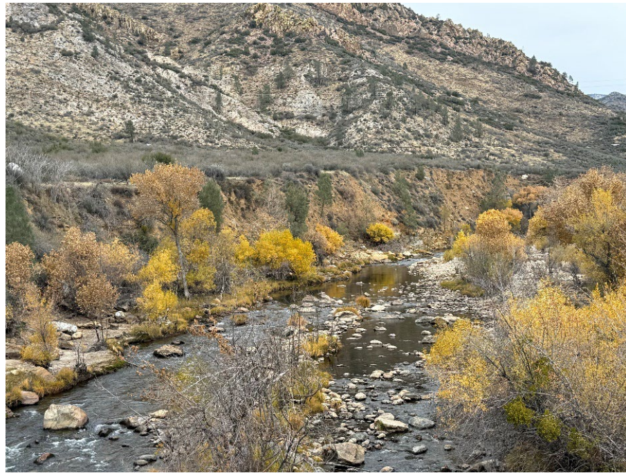
December 2, 2025: 52 cfs flow