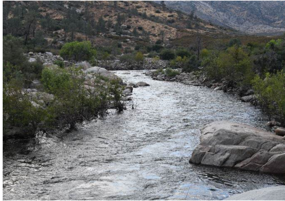
August 9, 2023: 891–1,000 cfs flow range