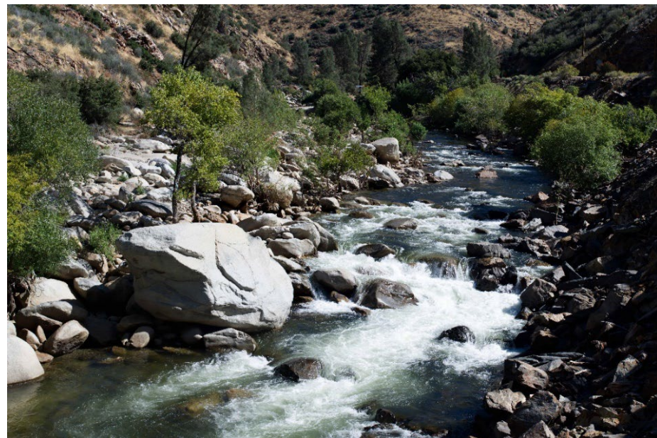
September 7, 2023: 331–381 cfs flow range