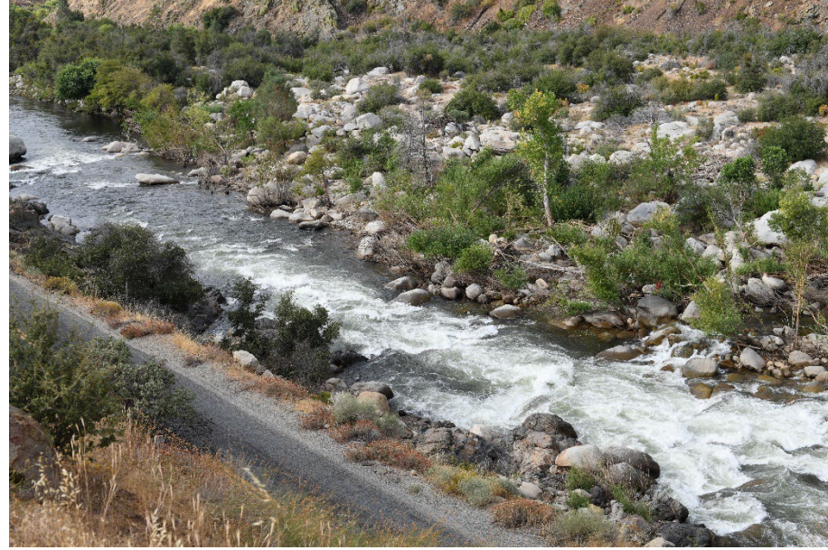
August 10, 2023: 891–1,000 cfs flow range