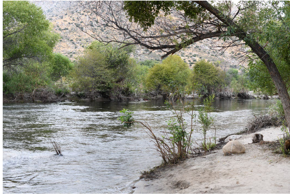
August 10, 2023: 891–1,000 cfs flow range