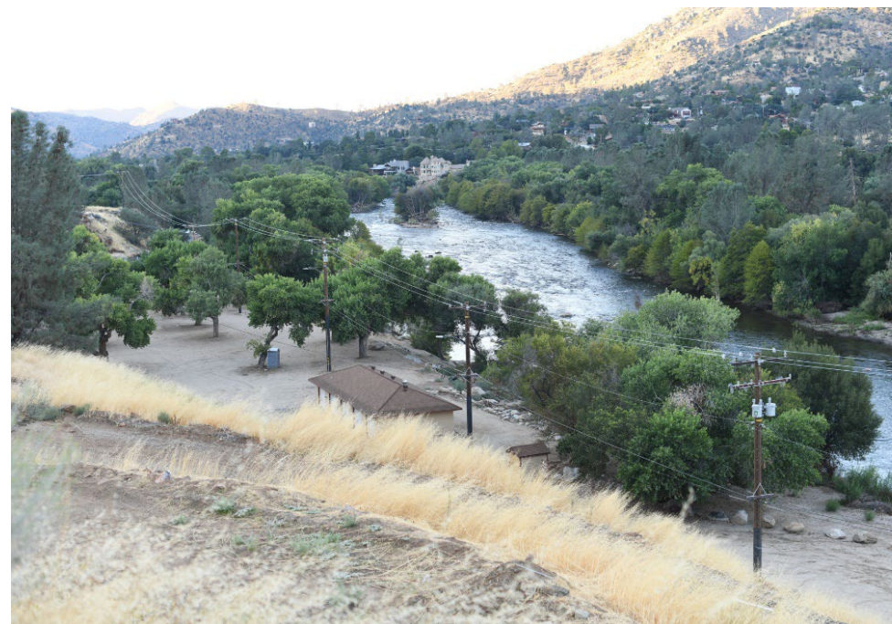
August 28, 2023: 1,276 cfs flow range