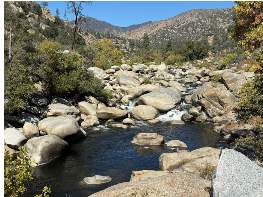
October 23, 2025: 91 cfs flow