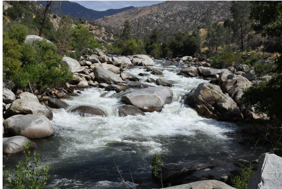
August 9, 2023: 891–1,000 cfs flow Range