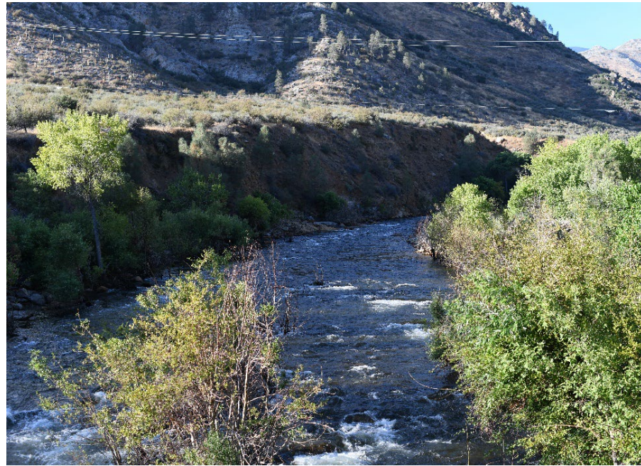
August 9, 2023: 891–1,000 cfs flow range