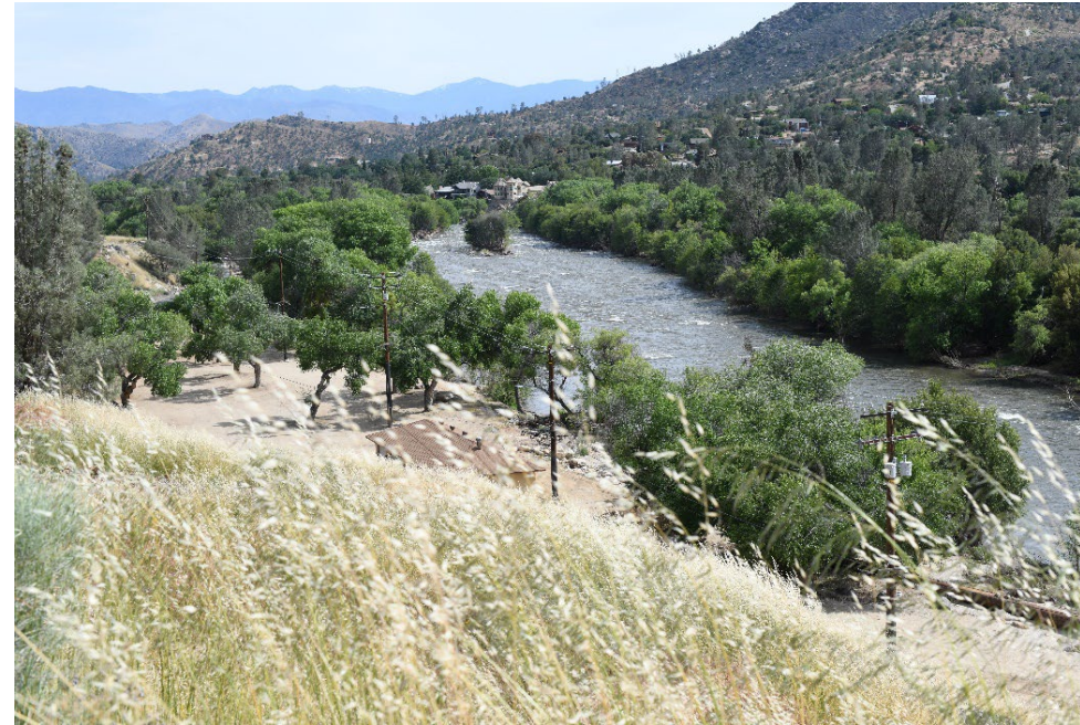
May 9, 2023: 3,678 cfs flow range