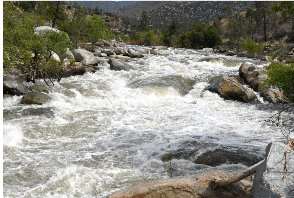
May 9, 2023: 3,676–3,874 cfs flow range