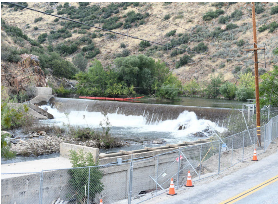
August 27, 2023: 719–829 cfs flow range