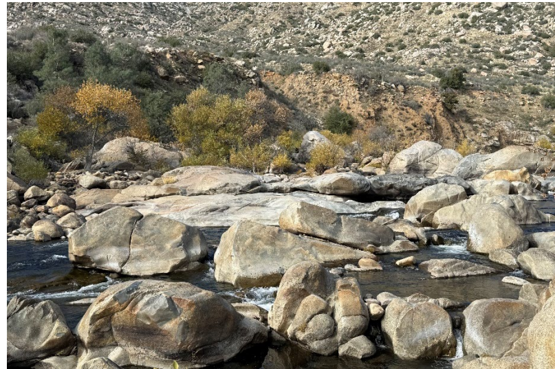
December 2, 2025: 52 cfs flow