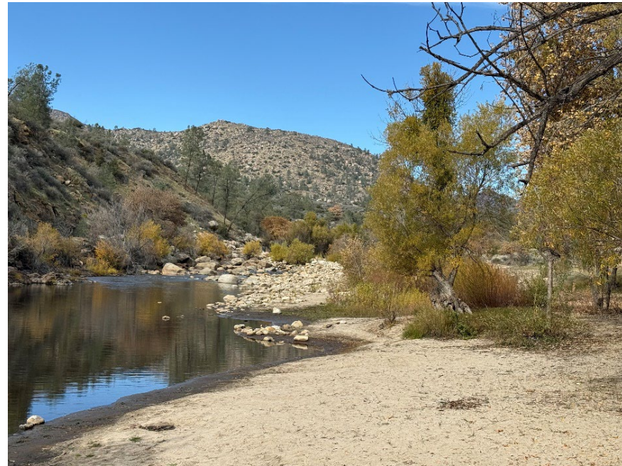
December 2, 2025: 52 cfs flow