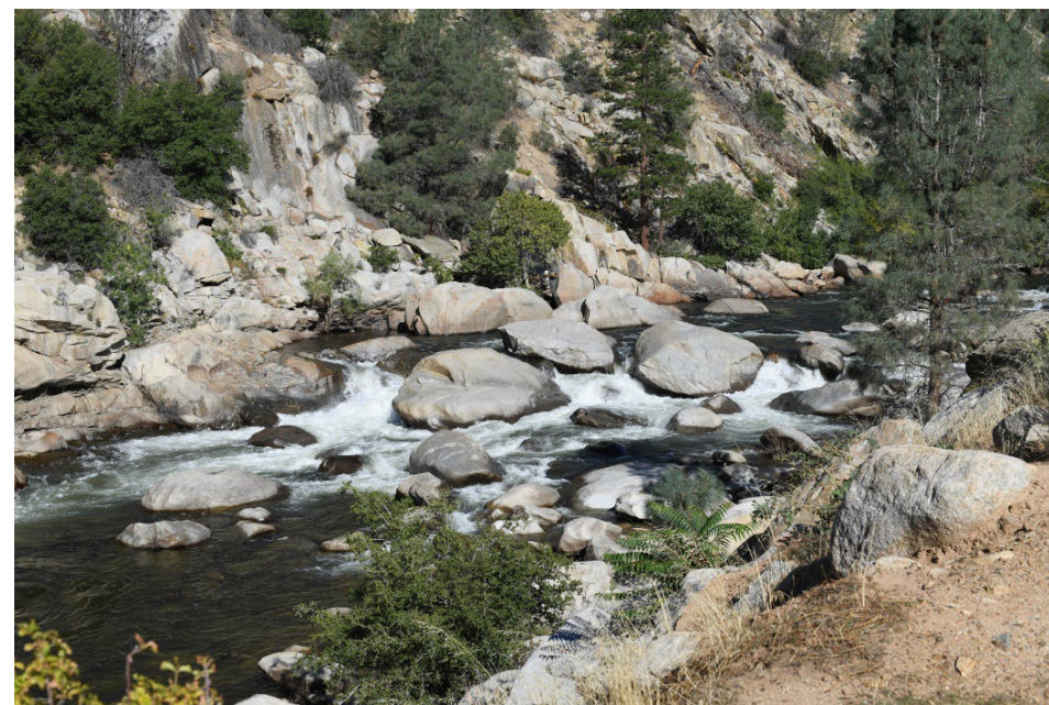
August 28, 2023: 719–829 cfs flow range