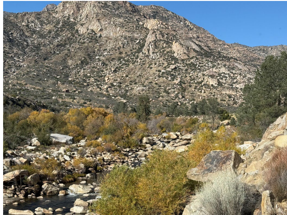
December 2, 2025: 52 cfs flow