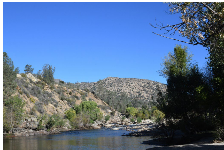
September 7, 2023: 331–381 cfs flow range