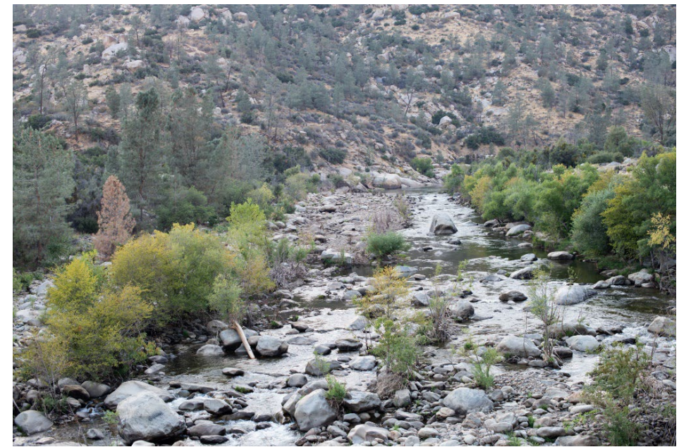
September 18, 2023: 134–160 cfs flow range