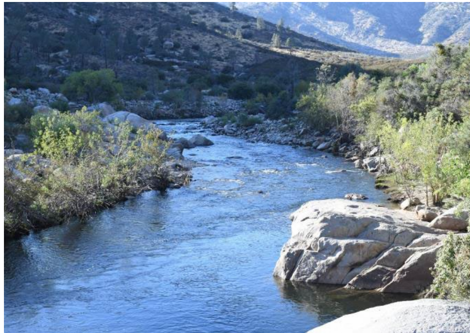
September 6, 2023: 331–381 cfs flow range