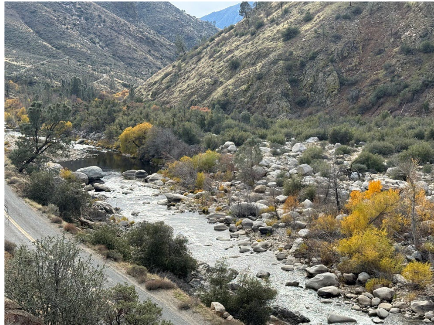
December 2, 2025: 52 cfs flow