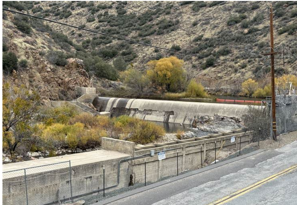
December 2, 2025: 52 cfs flow