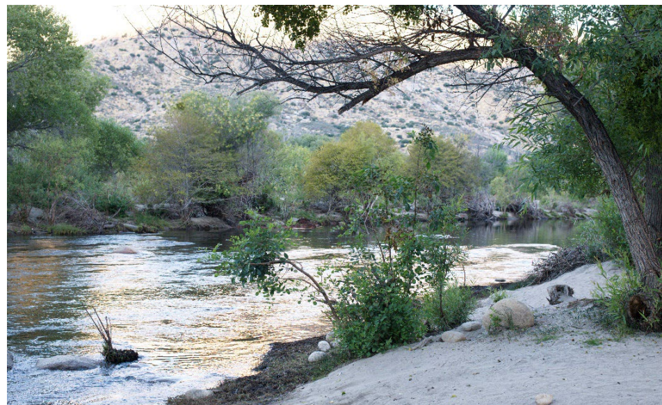
September 7, 2023: 331–381 cfs flow range