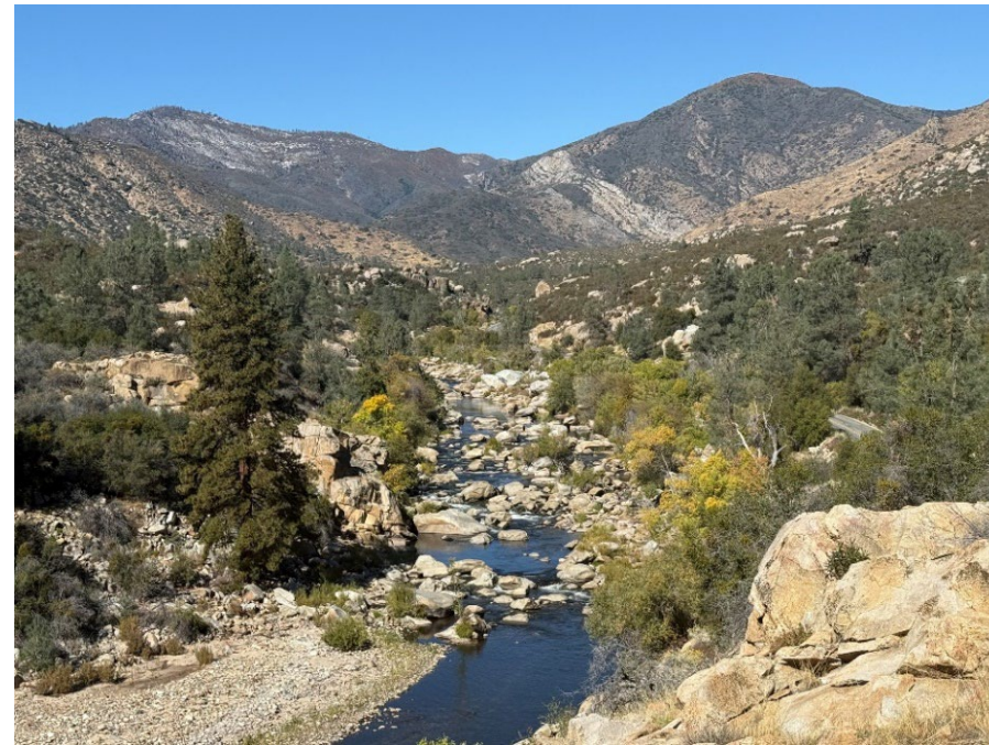
October 23, 2025: 91 cfs flow