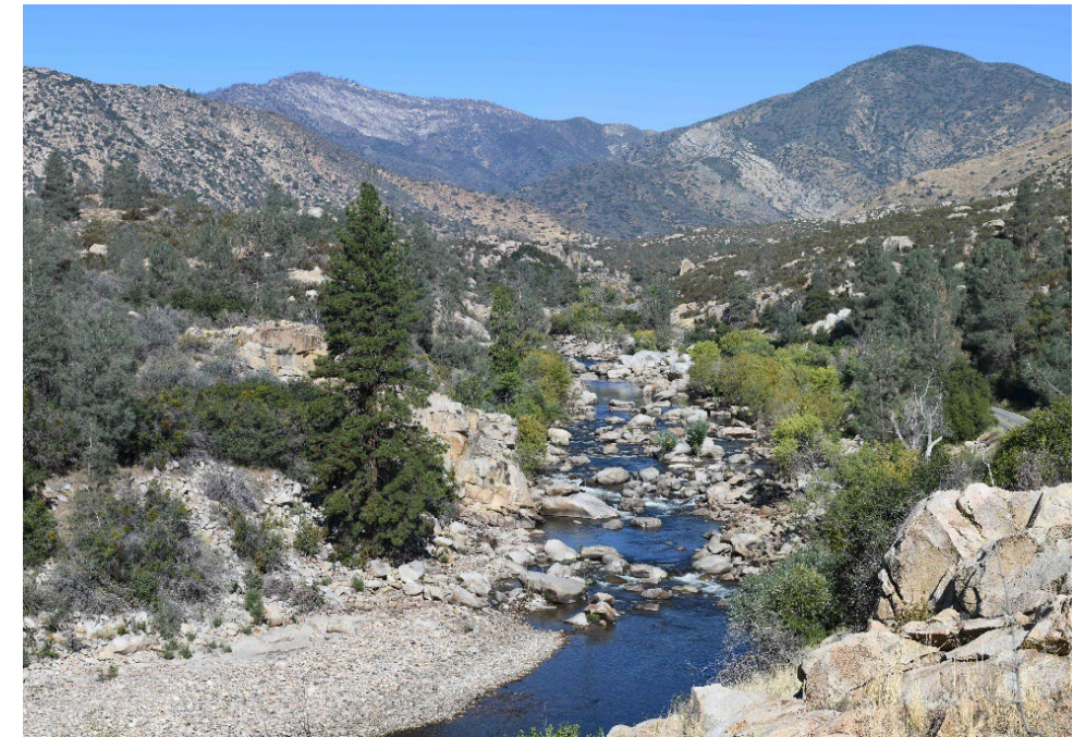
September 19, 2023: 134–160 cfs flow range