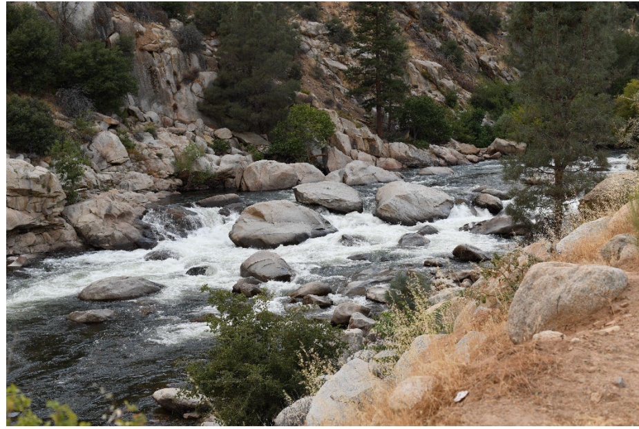
August 9, 2023: 891–1,000 cfs flow range