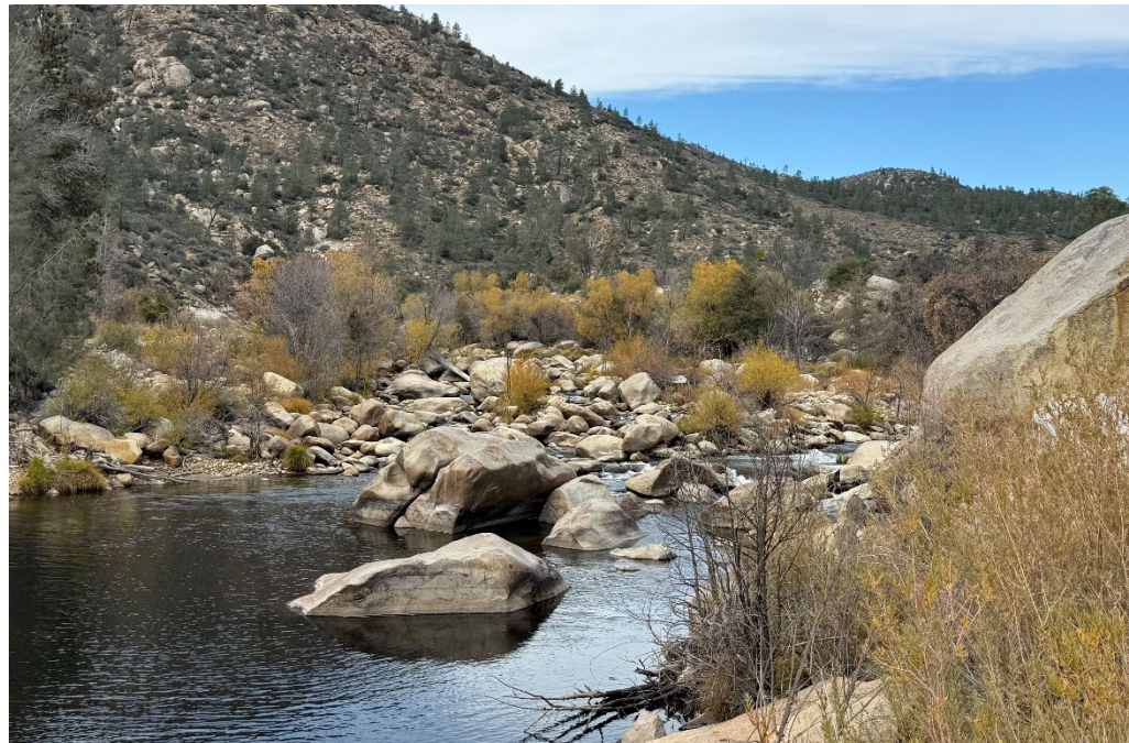
December 2, 2025: 52 cfs flow