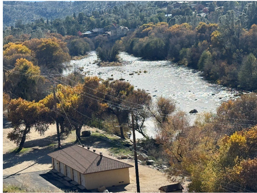
December 2, 2025: 361 cfs flow