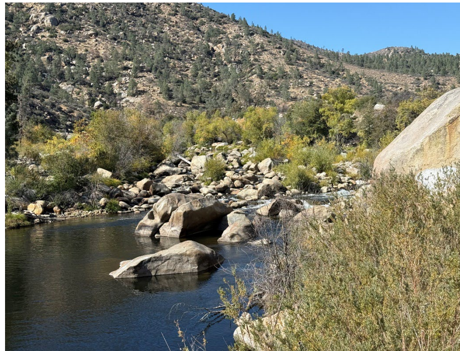
October 23, 2025: 91 cfs flow