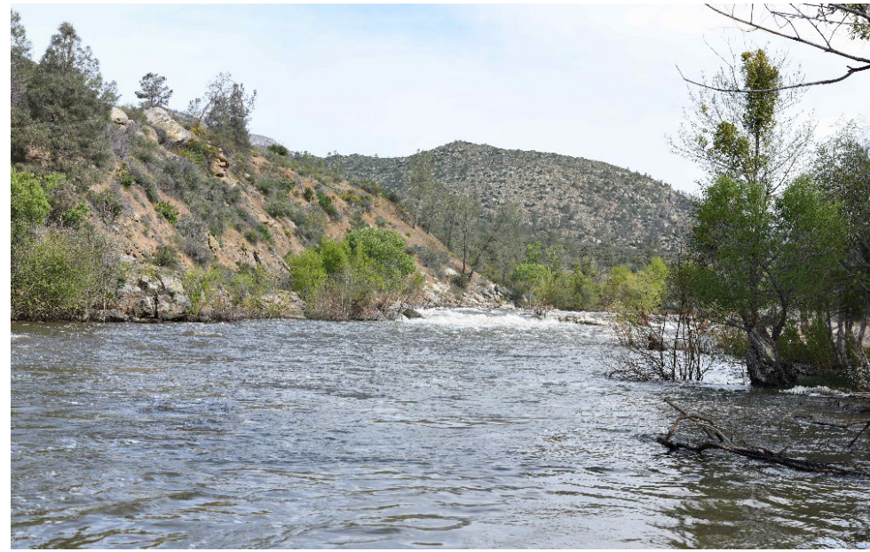
May 9, 2023: 3,676–3,874 cfs flow range