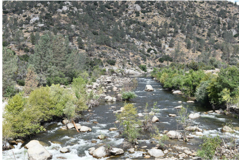
August 10, 2023: 891–1,000 cfs flow range