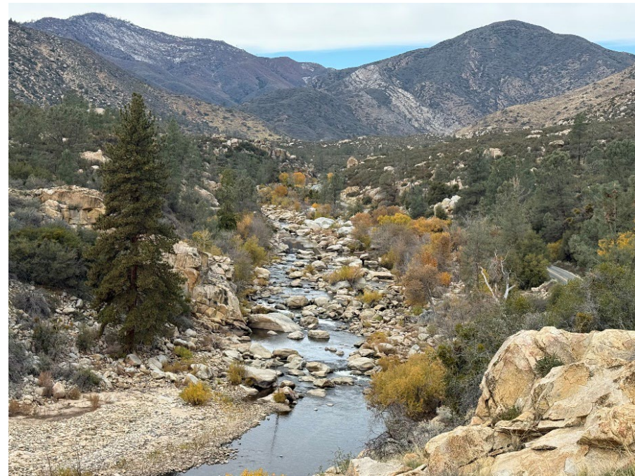
December 2, 2025: 52 cfs flow