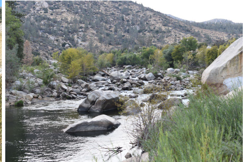
September 19, 2023: 134–160 cfs flow range