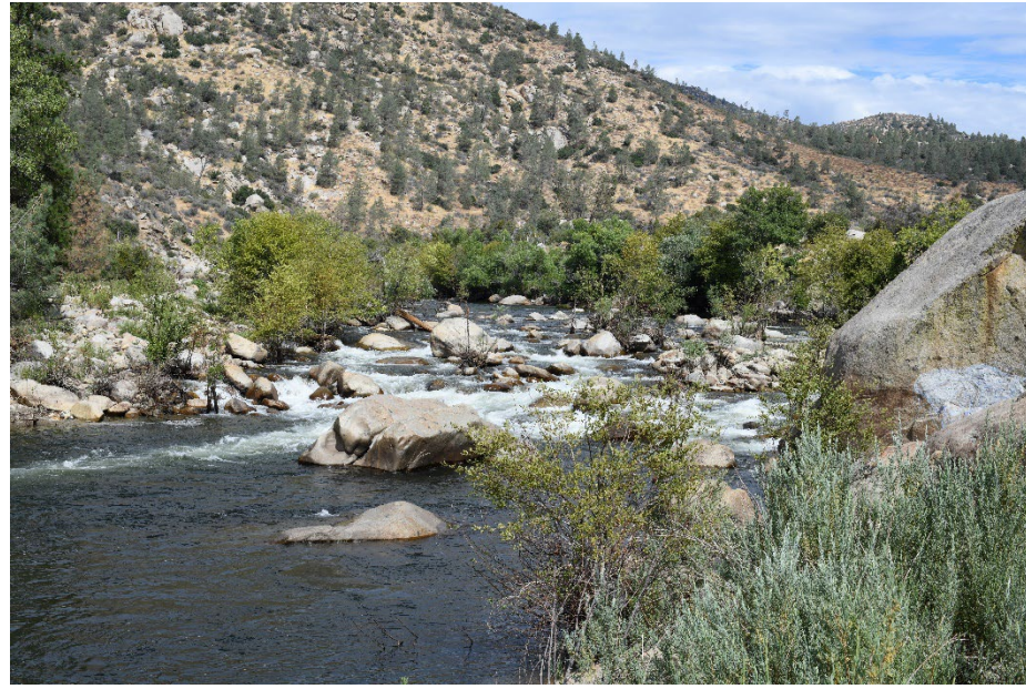
August 10, 2023: 891–1,000 cfs flow range