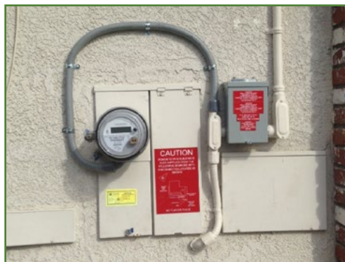
Exhibit #2 Completed Meter