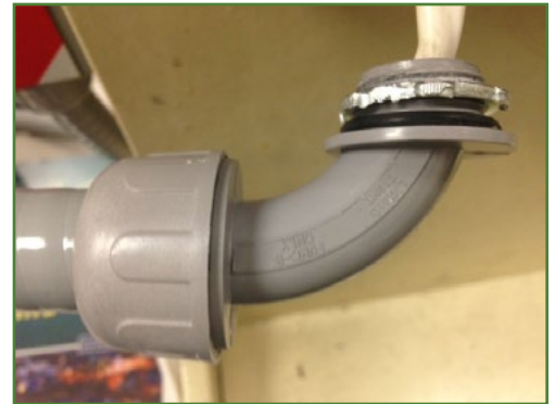
Bottom of Bent Connector