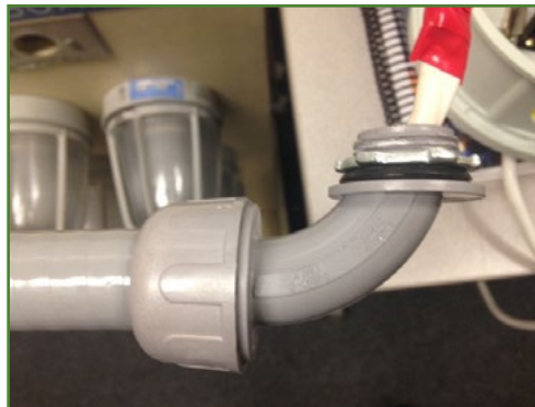
Red tape around section of pump/ Bent Connector

Top and side entry is not available at this time. However, in most cases, the "bottom" feed connection has worked well even with the breaker door underneath the meter. This is with the bent connector and not the straight connector.