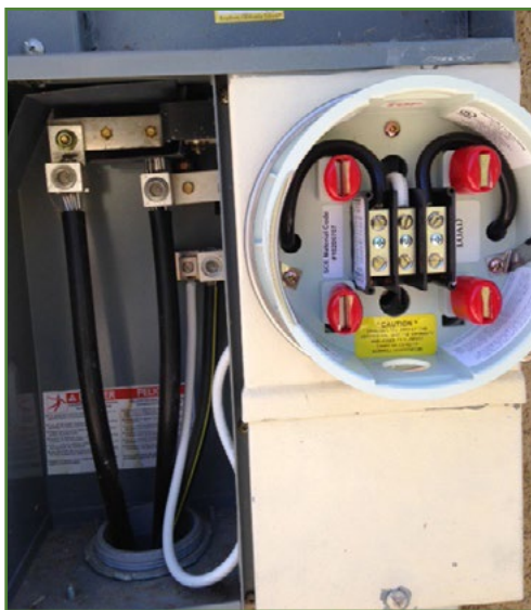
Exhibit #1: Multi-port connection

The two pigtail connection options are a multi-port connector or field installed lug, as shown in the pictures below. Crimp, splice or tap are not acceptable options.