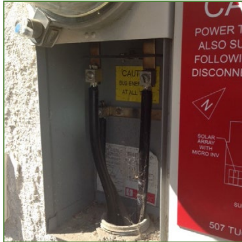
Exhibit #1 Panel Wiring