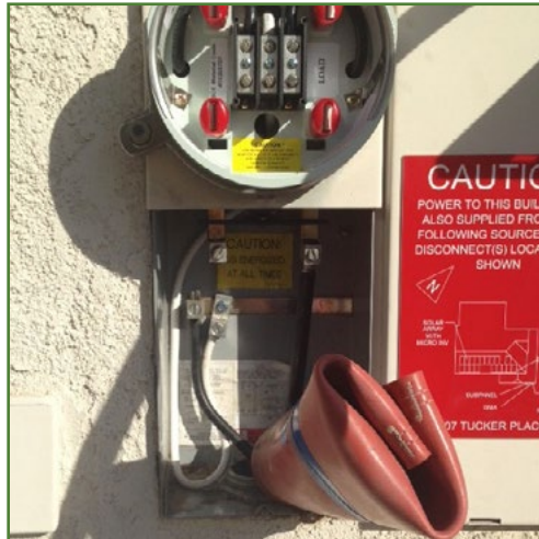
Exhibit #2 GMA installation