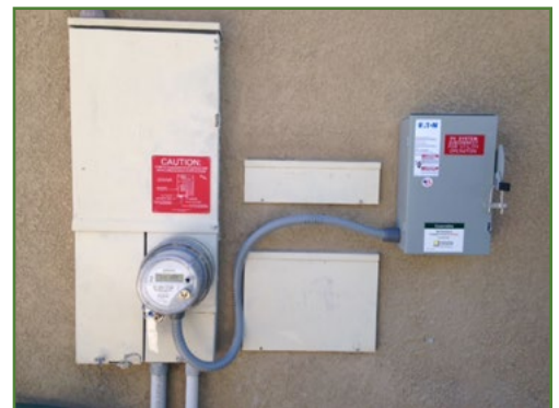
Securing a Flexible Conduit on the GMA Installation