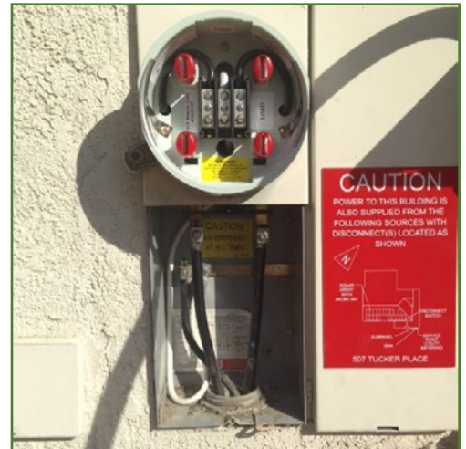
Exhibit #2 wiring