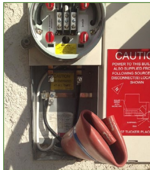
Exhibit #2: Field Lug Connection