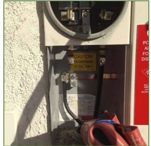
Exhibit #2 Completed Meter + GMA installation + wiring