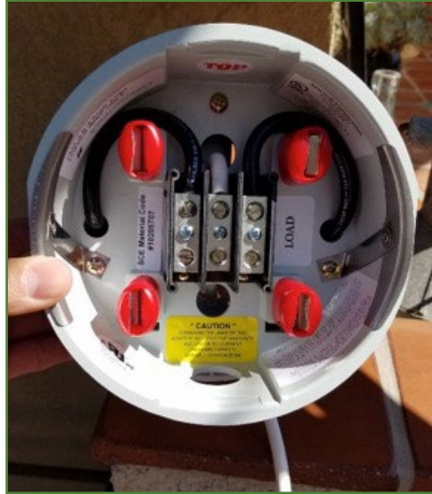
The internal Underside of the GMA

The demarcation between SCE and the customer is the wire connection to the A/C disconnect in the GMA at the termination block (i.e., 2 wires for 120 V or three wires for 240 V 200 amp service panel). The neutral pigtail is the white wire included in the GMA and it is installed and owned by SCE.