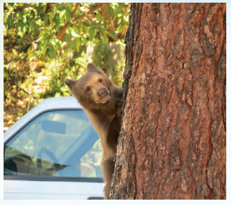
TRTP construction crews regularly encounter a variety of wildlife, such as this black bear cub which was spotted in Duarte last September. Construction crews receive training on how to work safely knowing wildlife are in the areas we are building.

The number of dollars SCE paid in property taxes in the 2013-2014 tax year. SCE pays property taxes twice a year to each of the 19 California counties in which it owns land, land rights or facilities.